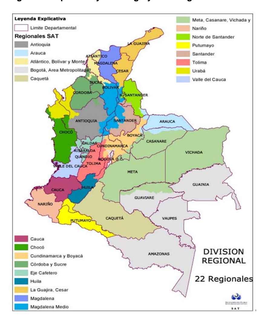
Figure 1. Map of Early Warning System Regions

Despite the progress and achievements made by the program thus far, some issues need management attention. The following sections discuss needed actions to make the EWS more independent, restart the process of developing a National Action Plan for human rights, and revise the approach to human rights contingency planning.