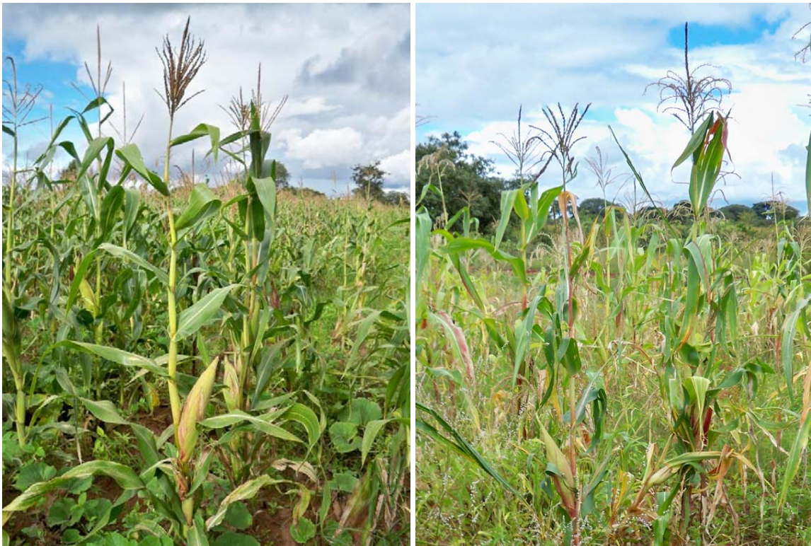
Maize in a demonstration field in Siakacheke, Choma District (left), thrives compared with maize in a conventional field in Milangu, Kazungula District (right). (Photo by Regional Inspector General/Pretoria, March 2010)

For example, in the community of Siakacheke, the auditors observed a field that was used to demonstrate new agricultural techniques and equipment to approximately 20 beneficiary farmers. With the training and equipment, the beneficiaries had the field ready for planting when the first rains came in late November 2009, while other farmers were unable to plant until December. The difference between the mature crops in the demonstration field and the younger crops in neighboring fields was evident, as shown in the photos below. Early planting is critical because if rainfall suddenly diminished or ceased, the mature crops would be more likely to survive than the younger crops.