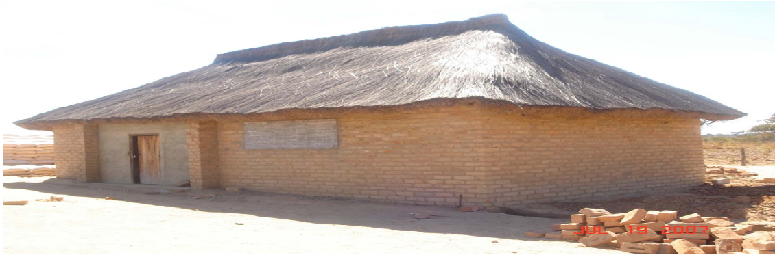
Bags of surplus maize (stacked in what appears to be a wall at left) are exposed to spoilage and theft at the Manyemunyemu shed prior to renovation.