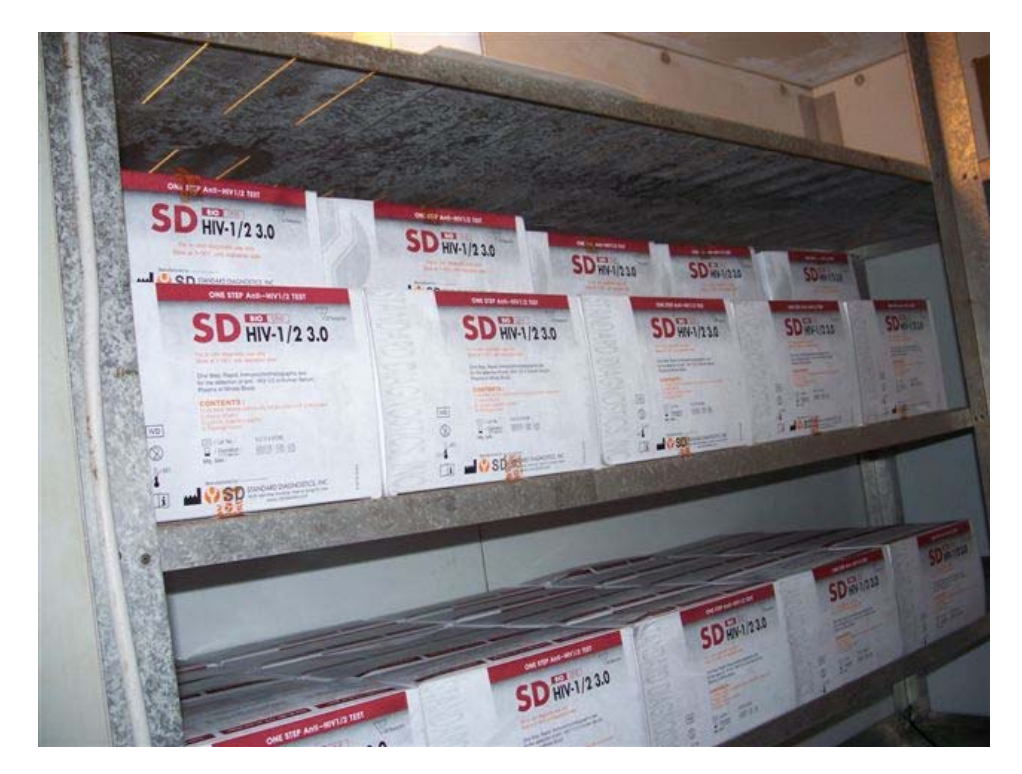
Test kits with short shelf lives stored at Ndanda District Hospital in Tanzania.

The management of PMTCT commodities at the service outlet level needed improvement in several areas. Five of the fourteen sampled locations lacked inventory records for test kits and antiretroviral prophylaxis. Bin cards (also known as stock cards) for these PMTCT commodities were not always updated when commodities were received and dispensed. Some cards had not been updated since 2005. In addition, bin cards frequently did not include beginning and ending inventory dates or commodity expiration dates. Without adequate inventory records, the providers' pharmacy staffs could not determine the current level of commodities on hand and, therefore, submitted orders for unnecessary additional stock. Moreover, at these five locations, the staff did not compute and maintain safety stock levels necessary to prevent running out of stock. One location was unable to use its test kits before the expiration dates, while five other locations had commodities that were near their expiration dates.