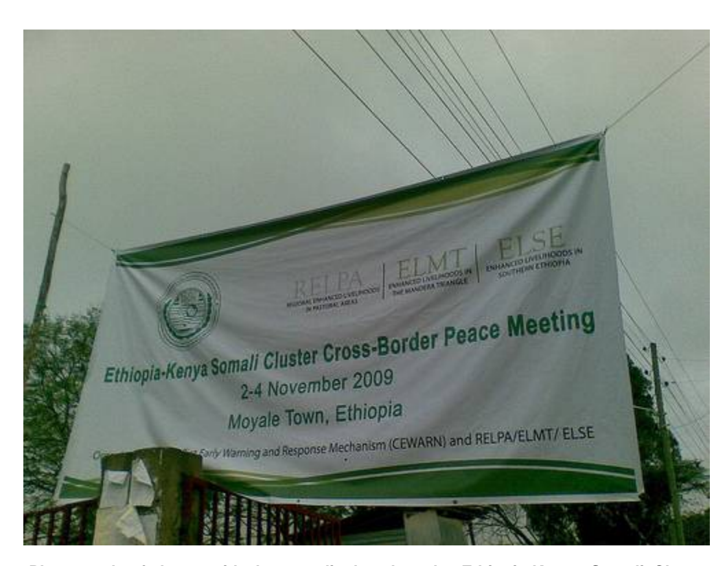
Photograph of the outside banner displayed at the Ethiopia-Kenya Somali Cluster Cross-Border Peace Meeting held at Moyale Town, Ethiopia, taken by a RIG/Pretoria auditor on November 3, 2009