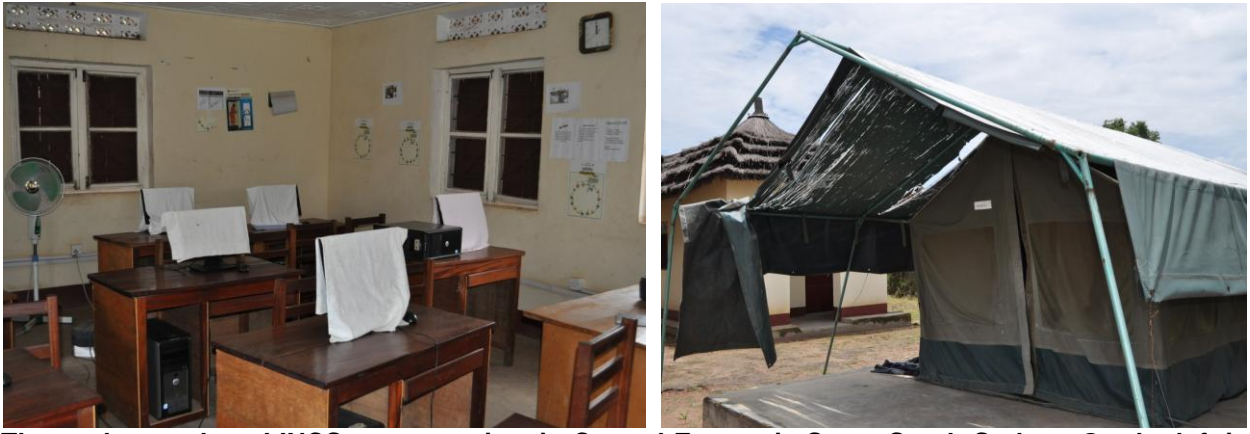
These photos show LINCS program sites in Central Equatoria State, South Sudan. On the left is an unused computer room without Internet access in Yei. On the right is a dilapidated lodging tent on the compound in Lainya.

In order to cut costs, some advisory boards have opened their computer rooms to the public as fee-based Internet cafes. Tours of these rooms and reviews of associated computer logs (Appendix IV) showed that the computer activity observed during our visits was rarely consistent with the original goal of fostering civil society. While struggling to maintain the financial viability of resource centers, the advisory boards were not able to focus on promoting civil society organizations and training.