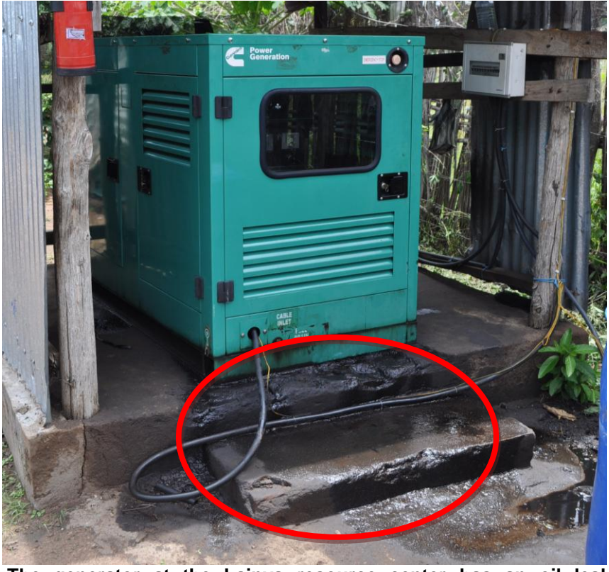
The generator at the Lainya resource center has an oil leak (circled) and works sporadically. (Photo by RIG/Pretoria, August 2011)

Despite this importance, auditors observed that advisory boards lacked the capacity and resources to operate their respective resource centers. During interviews, advisory board officials noted their inability to pay monthly phone, Internet, and fuel expenses, in addition to essential staff. At one resource center visited, the compound generator had an oil leak, as shown in the photograph below, and operated sporadically. At another center, the advisory board had been unable to pay satellite phone and Internet bills since Mercy Corps left. As a result, computer and Internet services were unavailable.