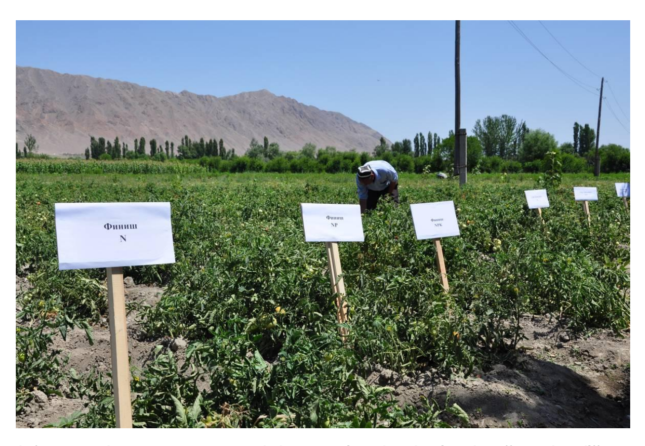
A farmer tends a program-sponsored demonstration plot showing the effects that different fertilizers have on tomato plants grown with certified seed.

An input dealer in northern Tajikistan stated that because of the program's onion demonstration plot and training provided to farmers, demand for imported seeds and pesticides had increased significantly. Whereas in the past the store had difficulty selling even 3 to 5 kilograms of high-quality, imported seeds per season, the dealer currently reported selling around 80 percent of the store's seed stock and planned to order as much as five times more for the next season.