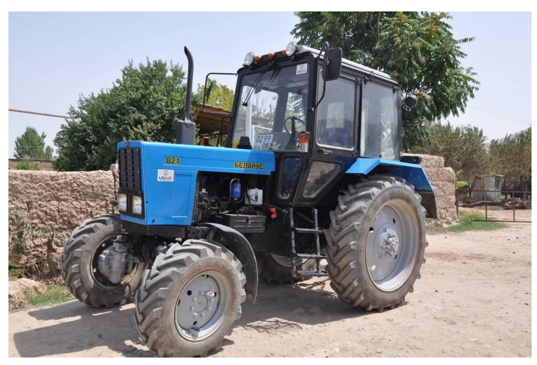
This tractor is one of 16 purchased by farmers through financial packages offered by the program.

Despite the demand, the contractor inexplicably had not submitted any purchase requests for additional tractors beyond the current eight or other equipment. These requests are needed to help facilitate the millions of dollars of loans and investment the program originally envisioned, yet no plan exists to keep up with this demand.