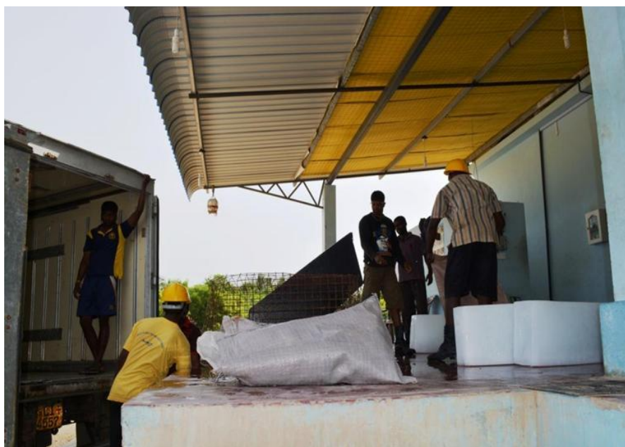
Workers load ice blocks at an ice production plant in Jaffna, Northern Province.

According to the grant agreement, the grantee planned to hire workers to distribute ice to three outlets that the grantee planned to build. These outlets would have made ice accessible to fishers, who use ice to preserve the quality of their catch and sell the fish at higher prices.