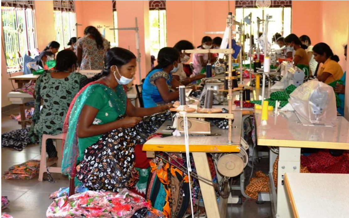
Women work in a garment factory in Vavuniya, Northern Province. (Photo by RIG/Manila, November 26, 2013)

equipment for grantees that received funding, and reducing the budget cut further slowed implementation.