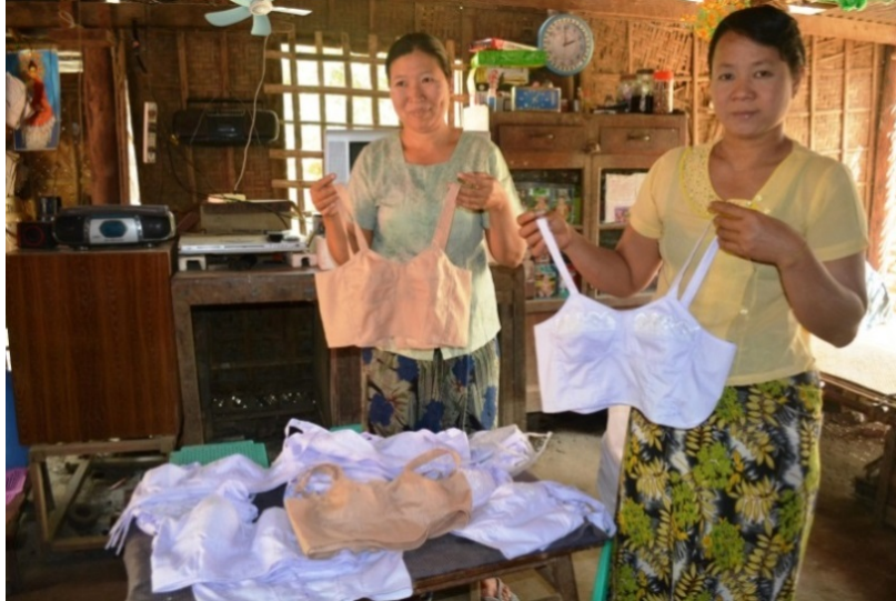
Entrepreneurs show garments made since they expanded their business from one sewing machine to three.