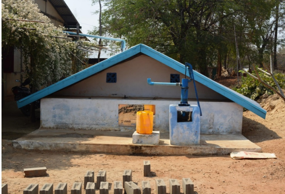
At this village in Meikhtila Township, rainwater collects in the roof, passes through the pipe extending from the front, and collects in the rectangular tank. (Photo by RIG/Manila, March 2015)