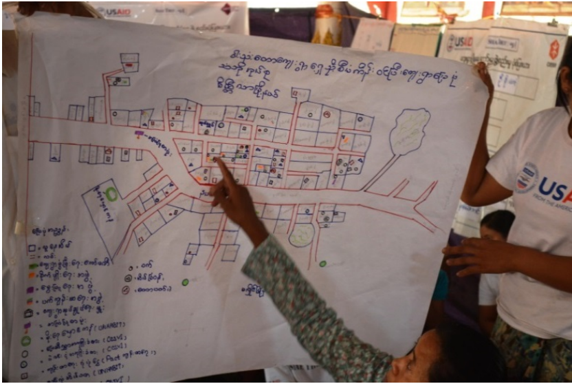
Villager points out households that directly benefited from partner activities. (Photo by RIG/Manila, March 2015)