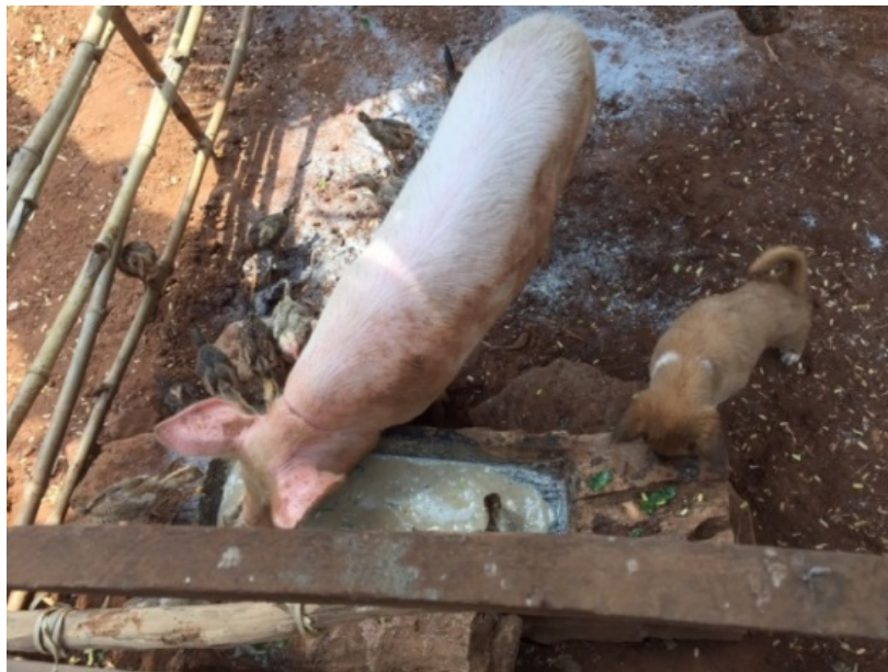
This pig is on loan from a village animal bank. The single parent borrowing it will sell some piglets and breed others to boost household income and food security.