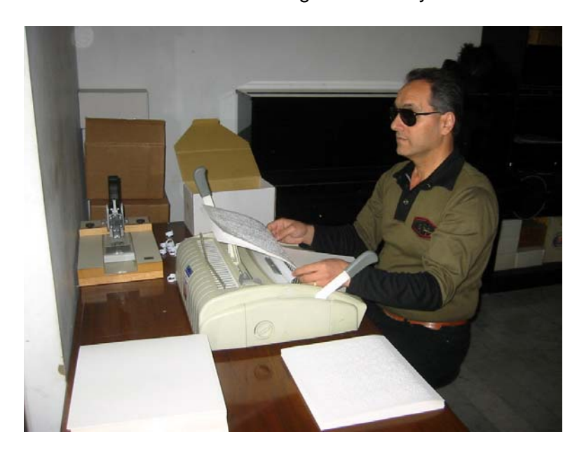
Volunteer at the blind association putting together copies of a Braille manual.

The Christian Association for the Blind received a $24,760 grant to create a guide on human rights in Braille and distribute 800 copies to blind residents in Lebanon to help this group of citizens to understand their rights in society.