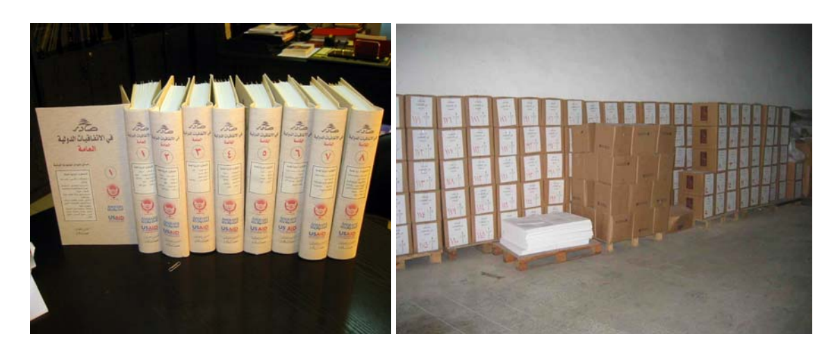
Boxes sitting at the grantee's warehouse waiting for distribution.

SADER Publishers received a $92,275 grant to develop, in coordination with the Ministry of Justice, a compilation of all international, multilateral, and bilateral treaties approved by the Lebanese Parliament and ratified for use by judges and courts nationwide. According to the grant agreement, this will lead to stronger application of the rule of law, thereby benefiting citizens, professionals, and investors. All judges will receive a copy of the books; however, according to the implementer, the distribution has been delayed because of the political situation and the books are being held in a warehouse.