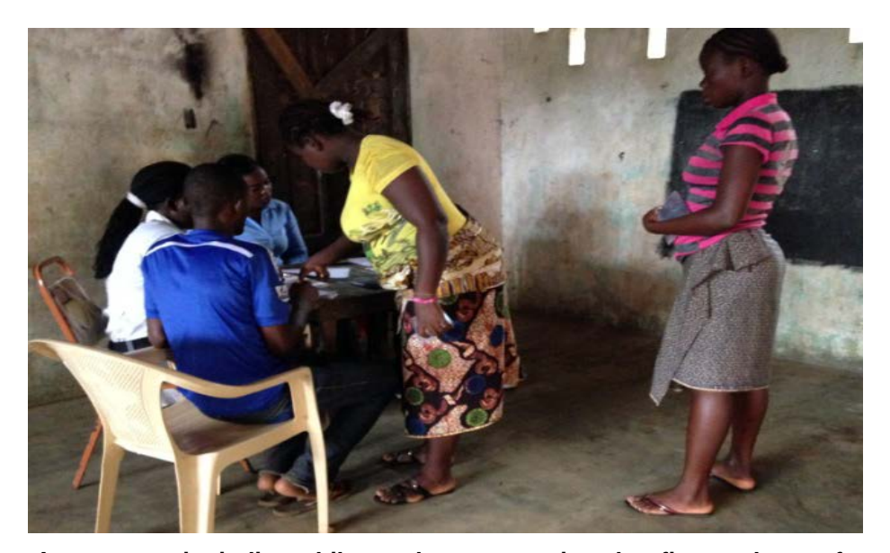
A woman waits in line while another one receives her first cash transfer from a cashier in Montserrado County, Liberia.

A beneficiary at Mercy Corps' cash transfer distribution in Montserrado County, Liberia (shown below) was one person the programs helped. She said that during the Ebola crisis, vendors in her community of Porte Hill closed their stores for 3 months, leaving her no place to sell rice. Since she did not have other options, she and her family had to eat their stock of rice. She said she intended to use the $42 transfer she received to help restart and improve her business.