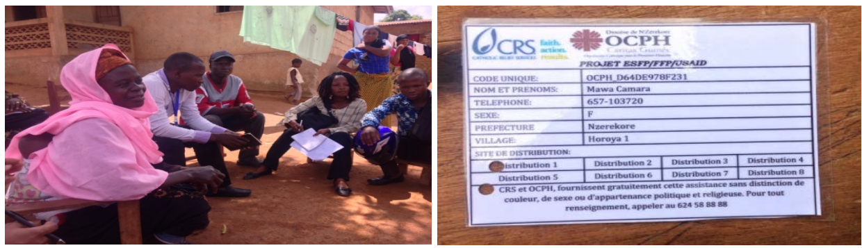
Beneficiaries of USAID/FFP programs receive identification cards like the one on the right.

Beneficiaries of Catholic Relief Services' program in the Horoya 1 Community, Nzérékoré Prefecture, Guinea, confirmed that they received their second food vouchers, worth 281,000 Guinean francs each (approximately $40). The beneficiary pictured below (far left) showed auditors her identification card, which implementer staff punch each time she receives a voucher.