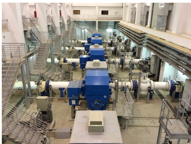
OPIC helped pay for this pump station, which provides water to Greater Amman. (Photo by OIG, October 22, 2014)

construction phase, and Diwaco reported that it created about 220 permanent jobs. Project officials said they did not need to import as much water since the pump station, shown in the photo below, began operating.