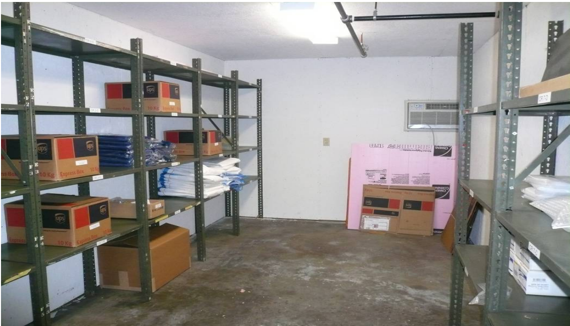
Photograph of the air-conditioned room at the warehouse in Savannah, GA, holding only a few items. Taken by an Office of Inspector General auditor on October 20, 2008,

Arrangement of Commodities – During site visits to the warehouses in Georgia and Indonesia, the audit team noted that stored commodities were not arranged to allow efficient warehouse management. In Georgia, items that were quarantined (to be