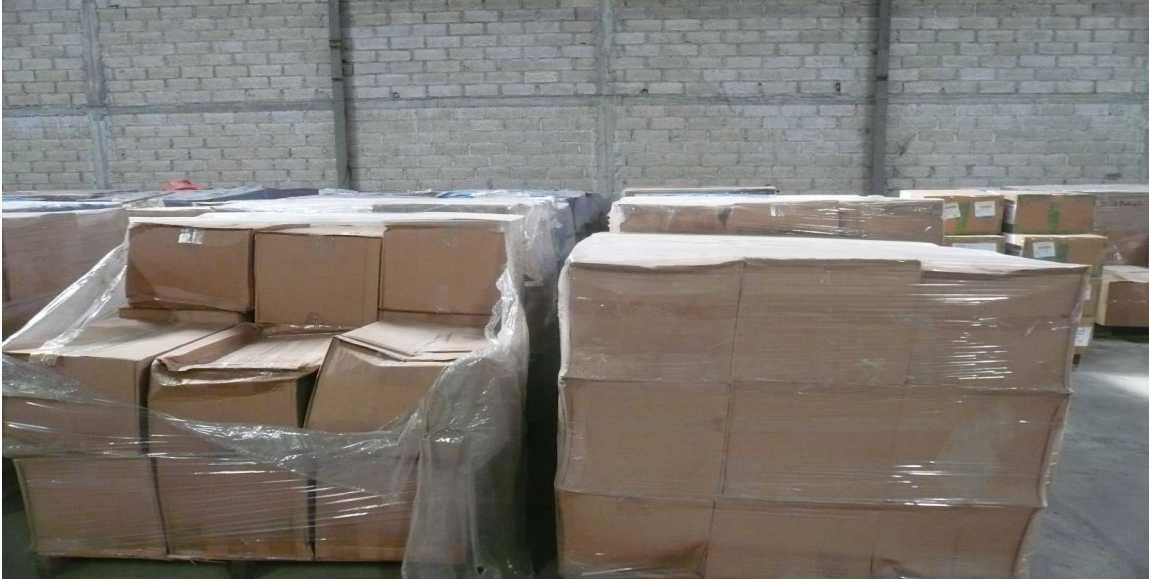
Photograph of commodities at the United Nations Food and Agriculture Organization warehouse in Jakarta, Indonesia. The absence of aisles in the arrangement of commodities restricts access to the stockpile. Taken by an Office of Inspector General auditor on November 19, 2008.

According to the warehouse manager, since the personal protection equipment did not have an expiration date, he did not see the need to use the older inventory. However, even though the personal protection equipment does not have an expiration date, it is good management practice to use the first-in/first-out inventory system. Orderly storage of the commodities could result in better quality and efficacy. It should be noted that the warehouse in Indonesia is under the control of United Nations Food and Agriculture Organization and not USAID. Therefore, this audit makes the following recommendations: