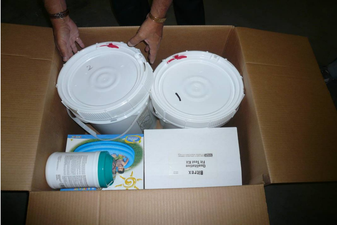
Photograph of commodity kits being reassembled at the Medical Assistance Program warehouse in Savannah, Georgia, a process which involved opening each kit individually and removing and replacing items as determined by the Avian Influenza Unit at USAID. Taken by an Office of Inspector General auditor on October 20, 2008.

Although USAID's Avian Influenza Unit has made notable improvements in managing the commodity stockpile, opportunities exist to improve performance management or program operations related to (1) determining the usefulness of the regional distribution center; (2) reducing excess warehouse space; (3) disposing of unusable, expired, and damaged commodities; and (4) documenting an understanding with the United Nations Food and Agriculture Organization in Indonesia.