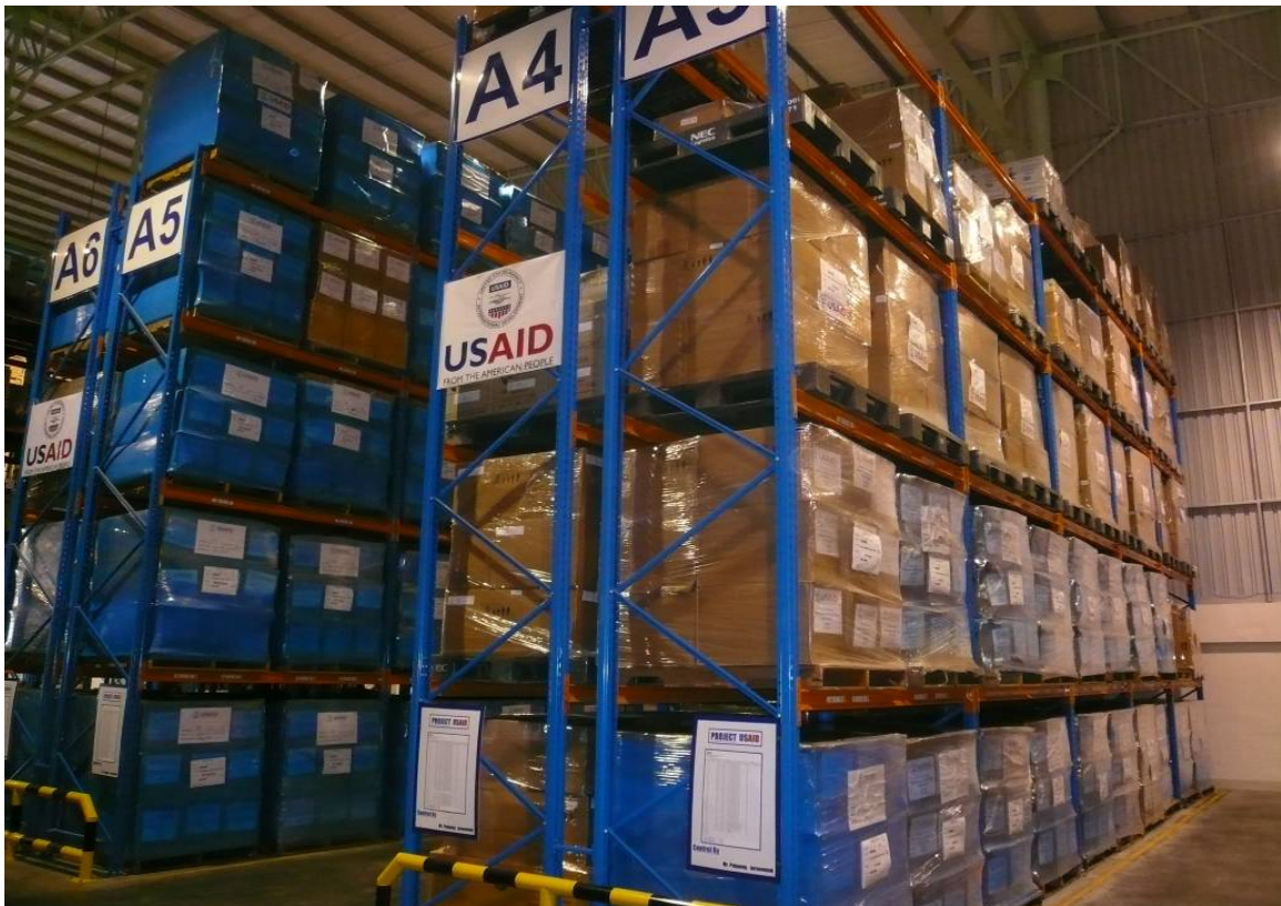
Photograph of avian influenza commodities stockpiled at the UPS warehouse in Bangkok, Thailand. Taken by an Office of Inspector General auditor on November 12, 2008.

Storage conditions generally met the standard warehouse operating procedures approved by USAID at both warehouses. (See appendix III for the standards tested.)