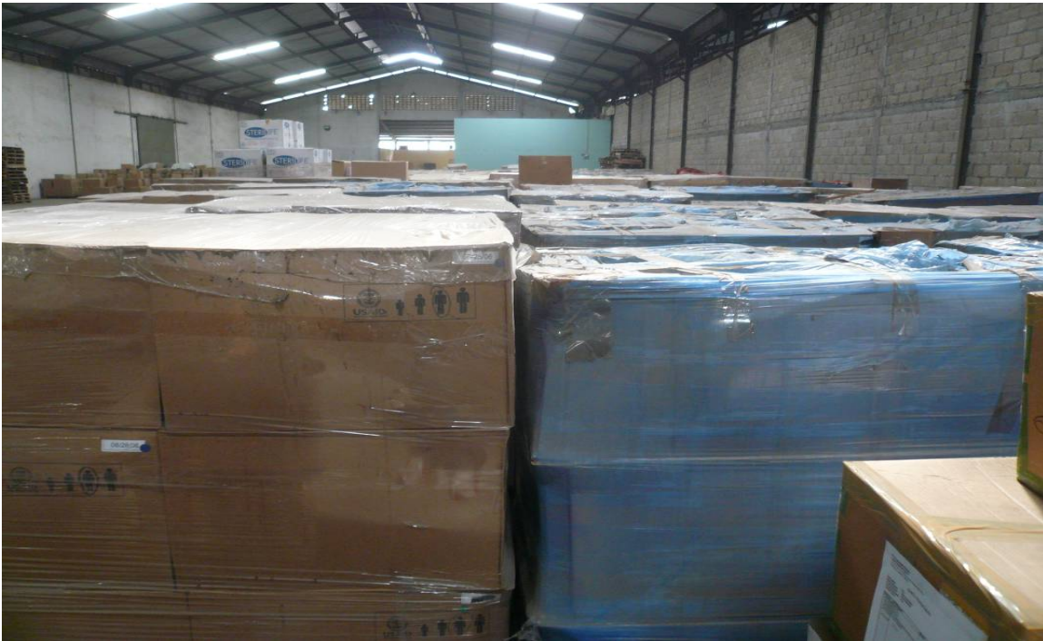
Photograph of older commodities in the back rows at the United Nations Food and Agriculture Organization warehouse in Jakarta, Indonesia, collecting dust for long periods of time without being shipped.

In Indonesia, the audit team noted that items to be disposed of were located in the same areas as items in good condition and ready to be shipped, and USAID items were stored with non-USAID commodities. In addition, there were no clear aisles, and the commodities were not arranged to allow for easy access. Because there was limited access to the older inventory (specifically, the personal protection equipment) located in back, newer inventory was stored in front and was also being shipped out first, leaving the older commodities untouched.