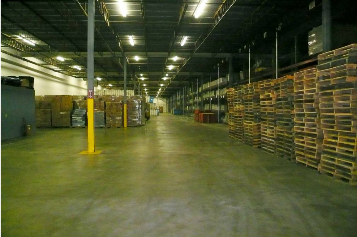
Photograph depicting one example of the excess space available in the warehouse in Savannah, GA. A large amount of floor space is vacant and commodities are not stacked as high as they could be stacked. Taken by an Office of Inspector General auditor on October 20, 2008,