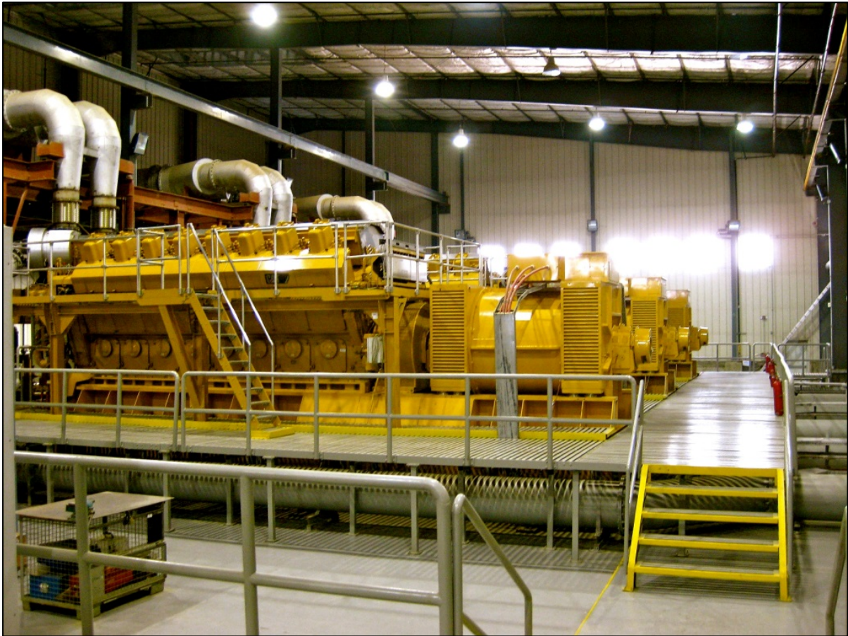
Generators in Tarakhil’s Block B remain idle because of a control system malfunction. (Photo by OIG, January 23, 2014)

Problems such as these and the inability to fix them quickly stemmed from the sophistication of the power plant, which is the only one of its kind in Afghanistan and uses advanced technology. The evaluation conducted on the plant’s operations in 2011 emphasized that staff needed additional training to operate the equipment and related control systems. It noted that “items such as the SCADA system that controls the power plant are state-of-the-art, anywhere in the world. It takes highly qualified and well-trained personnel to operate and maintain these types of systems.” An engineer in the mission’s infrastructure office commented on the situation and said that a sizeable gap exists between the technology at the power plant and staff members’ skills.