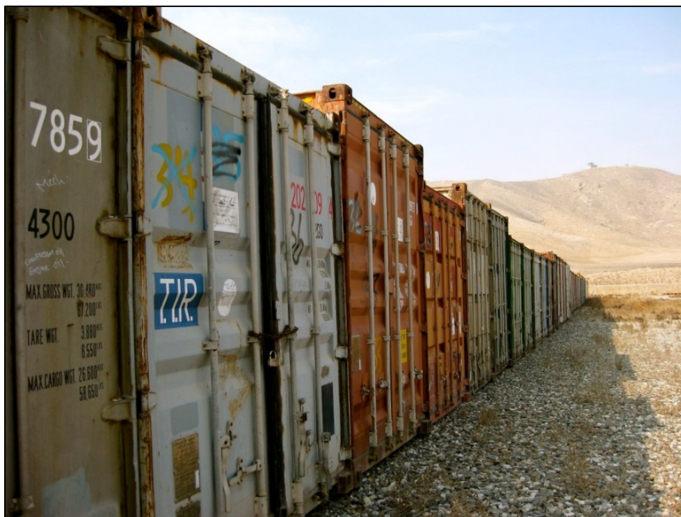
Shipping containers house spare parts, supplies, and materials, most of which were not inventoried. (Photo by OIG, January 15, 2014)