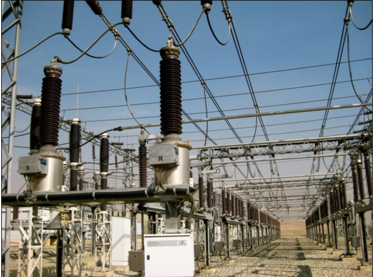
The substation at Tarkhil where circuit breakers and other equipment are used to connect the power generated at the plant to the grid. (Photo by OIG, January 23, 2014)

Operators also rely on another control system to monitor the status of the power plant's circuit breakers, located in the plant's substation (shown below), which connect the power generated at the plant to the grid. Collectively, these control systems work together to automate the myriad processes involved in generating power at the plant and are essential to its operations.