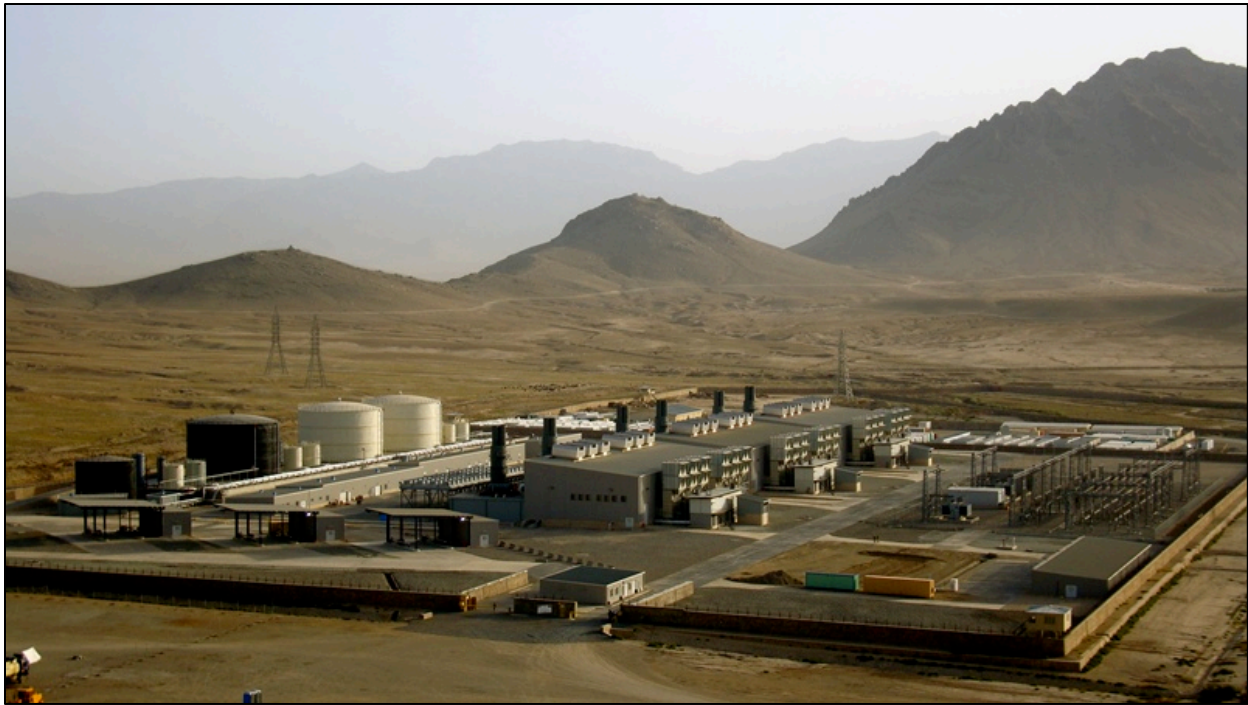
The Tarakhil Power Plant, located on the outskirts of Kabul, has 18 diesel generators capable of generating 105 megawatts of electricity. (Photo from mission archives, September 2010)