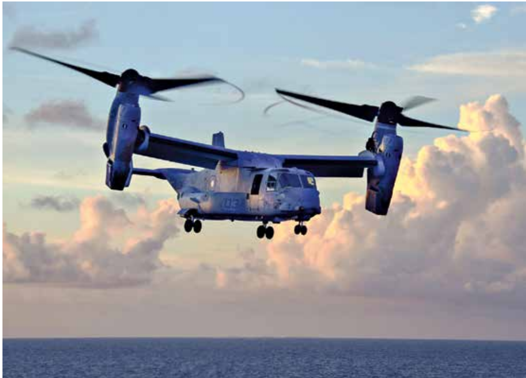
An MV-22 Osprey approaches the amphibious assault ship USS Wasp during flight operations in the Philippine Sea.