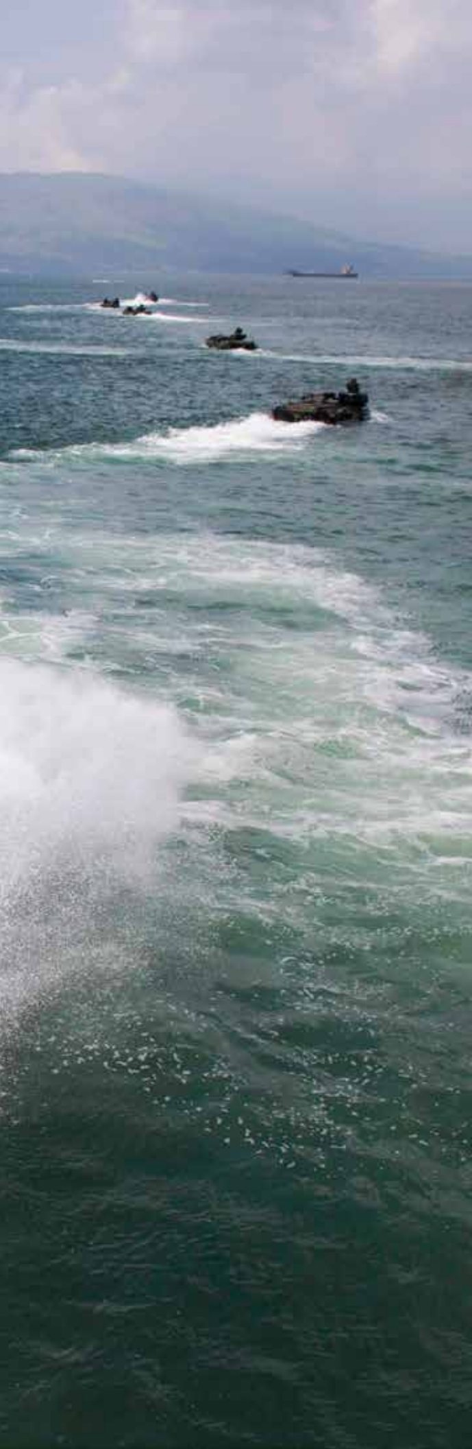
USMC assault amphibious vehicles depart the well deck of the amphibious dock landing ship USS Ashland during well deck operations.