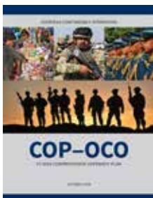
FY 2019 Comprehensive Oversight Plan for Overseas Contingency Operations

Pursuant to Section 8L of the Inspector General Act, the Lead IG develops and implements a joint strategic plan to guide comprehensive oversight of programs and operations for each overseas contingency operation. This effort includes reviewing and analyzing completed oversight, management, and other relevant reports to identify systemic problems, trends, lessons learned, and best practices to inform future oversight projects. The Lead IG agencies issue an annual joint strategic plan for each operation.