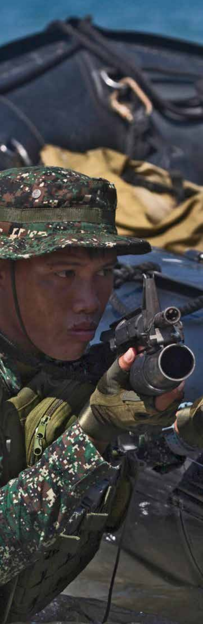
Philippine Marines secure a beach while conducting an amphibious training exercise.