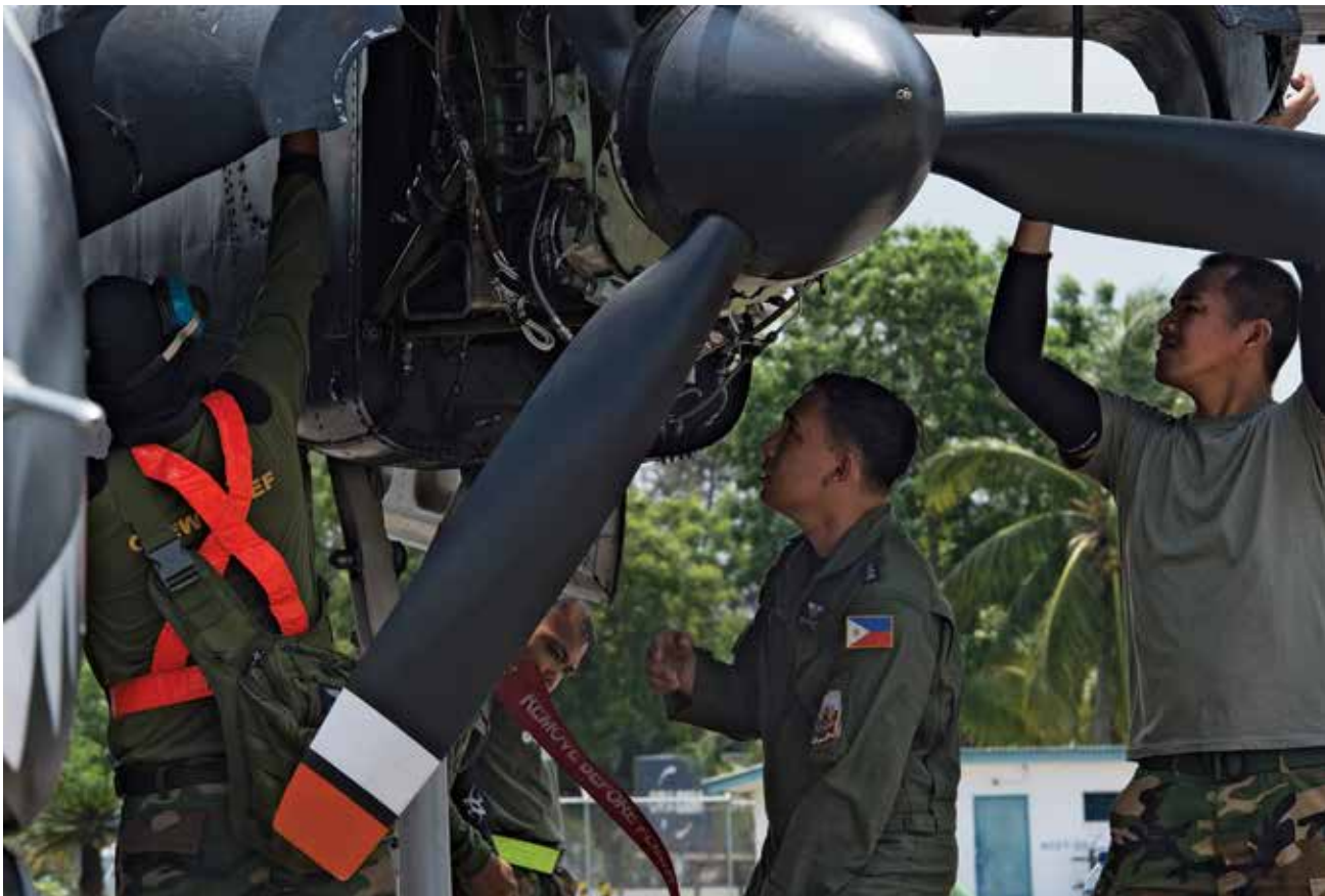
Philippine Air Force crew chiefs perform maintenance on an OV-10A/C Bronco at Clark Air Base, Philippines.

territorial waters and exclusive economic zone, where rival territorial claims currently exist, such as in the South China Sea. DoD officials noted that the SABIR system can also be used in counterterrorism operations, such as OPE-P, in the Philippine’s southern waters. 131