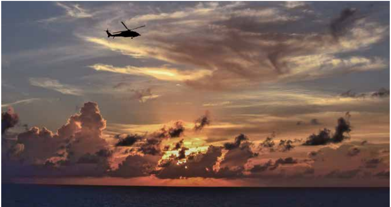
An MH-60S Sea Hawk helicopter participates in flight operations with the amphibious assault ship USS Wasp.