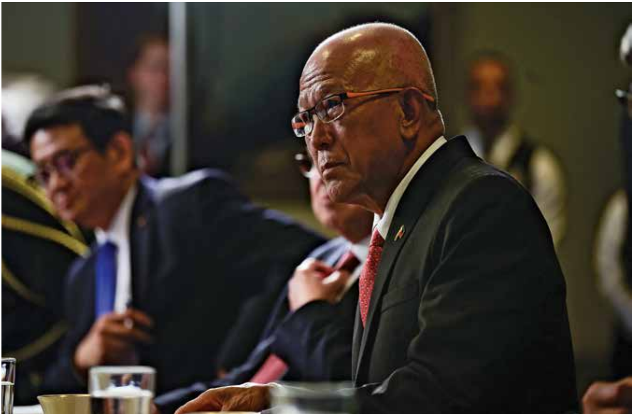
Philippine Secretary of National Defense Delfin Lorenzana meets with U.S. Secretary of Defense James N. Mattis at the Pentagon.