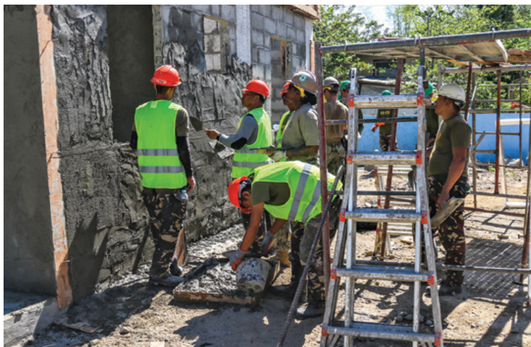
A U.S. Navy Petty Officer works alongside Philippine Army service members as they construct a new medical facility.