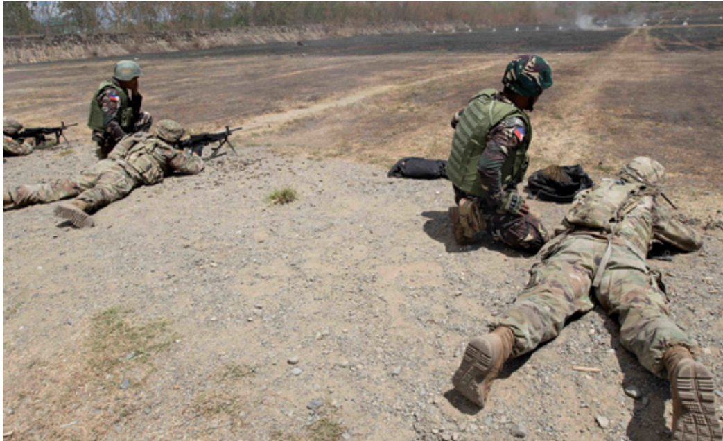
Filipino soldiers participate in a training exercise with U.S. Soldiers.

USINDOPACOM identified several pending FMS cases targeted to address the AFP's needs in ISR capacity. These included a national funds case valued at $50 million to connect a variety of ISR platforms and data sources into a single, secure data feed. The United States was planning to provide Foreign Military Financing of $29 million for ISR suites for up to five C-90 aircraft; $32 million for air search radars for the three Philippine Navy cutters (former U.S. Coast Guard vessels previously transferred to the Philippine government as Excess Defense Articles); and $4.48 million to sustain the Philippine Navy's Aerostat, a tethered dirigible ISR platform. 152