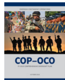
FY 2019 Comprehensive Oversight Plan for Overseas Contingency Operations

This quarter, the Lead IG agencies and their partner agencies completed two reports related to OPE-P. As of March 31, 2019, four oversight projects were ongoing, and three were planned. Table 2 lists the project titles and objectives for the ongoing projects, and Table 3 lists the project titles and objectives for the planned projects.