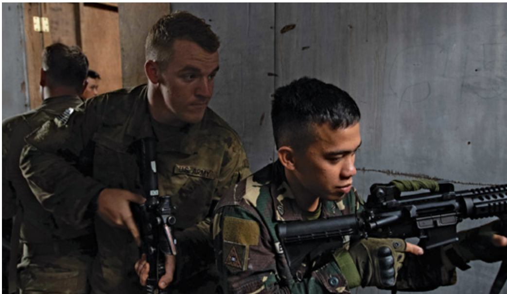
U.S. and Filipino soldiers conduct urban terrain training at Fort Magsaysay, Philippines.

According to the terms of the peace agreement, the MILF will hold a majority of leadership positions in the new government. This may create challenges, because many of the group's members are named on terrorist watch lists and few have experience in government. 16 They will now be tasked with governing 3.7 million of the Philippines' poorest citizens in a territory that includes the city of Marawi, still devastated from the siege of ISIS-P in 2017. 17 However, according to media reports, if both sides abide by the terms of the peace agreement, the MILF would ultimately decommission its full complement of 40,000 fighters and, by its cooperation with the national government, counter the ISIS-P narrative that the Philippine government is the enemy of the Muslim people. 18