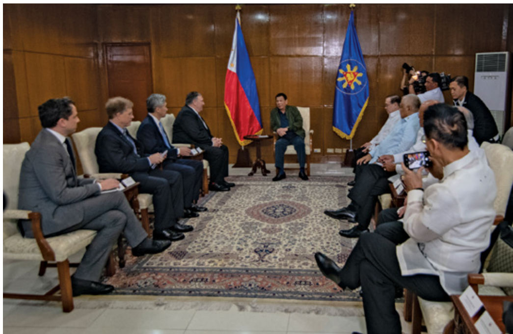
U.S. Secretary of State Michael Pompeo participates in a bilateral meeting with President of the Philippines Rodrigo Duterte in Manila, Philippines in February.

According to a February news report, U.S. Ambassador to the Philippines Sung Kim told reporters that the United States was open to a review of the MDT to determine if “any adjustments [are necessary] to make it even better.” 93 He added that while he considers the bilateral alliance “ironclad,” the importance and complicated nature of such a bilateral treaty require periodic review as circumstances around the agreement evolve. 94