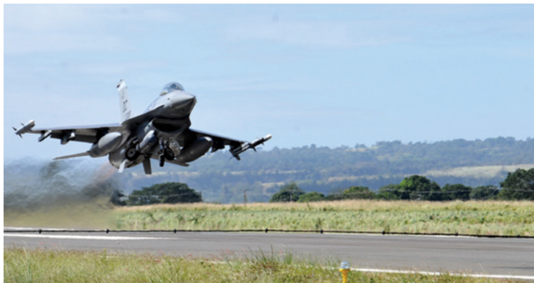
A U.S. Air Force F-16 Fighting Falcon takes off at Cesar Basa Air Base.

because of the area’s many like-minded violent extremist groups and the geography of the region, with many illicit points of entry from neighboring countries. Interior Secretary Año also testified that the fight against ISIS-P will require a whole of government approach, but martial law was a necessary component of this to “restrict the movement of armed groups from going from one place to another.” 73