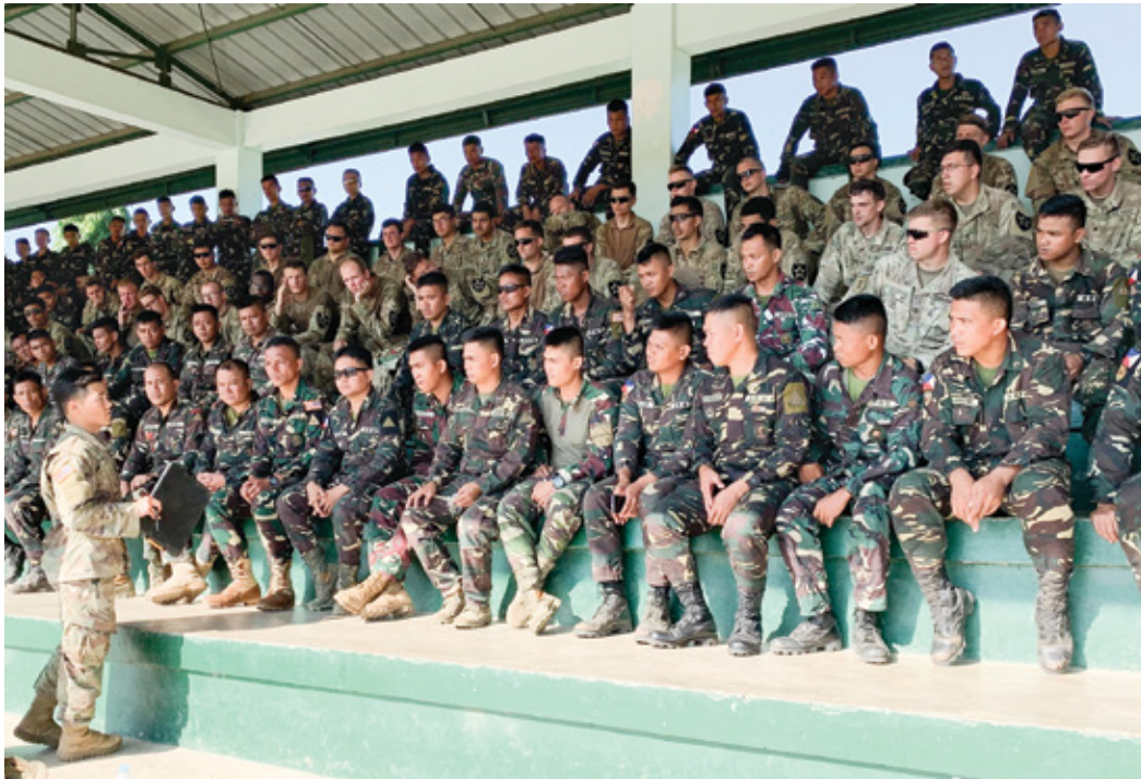
Soldiers of the Armed Forces of the Philippines listen to a safety brief with U.S. Army soldiers before firing their weapons at a range.