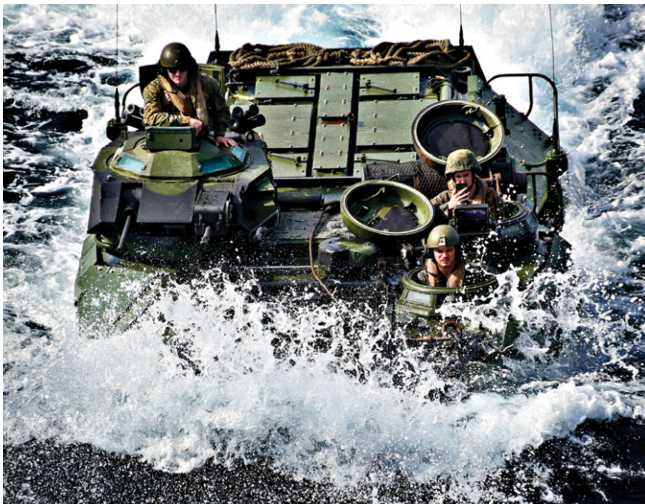
A U.S. Marine Corps amphibious assault vehicle approaches the well deck of the amphibious assault ship USS Wasp.