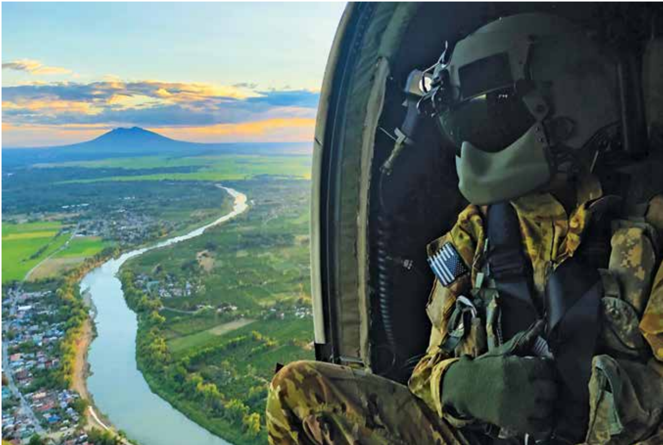
A U.S. Army crew chief studies terrain aboard a UH-60 Black Hawk helicopter as part of a flight survey.