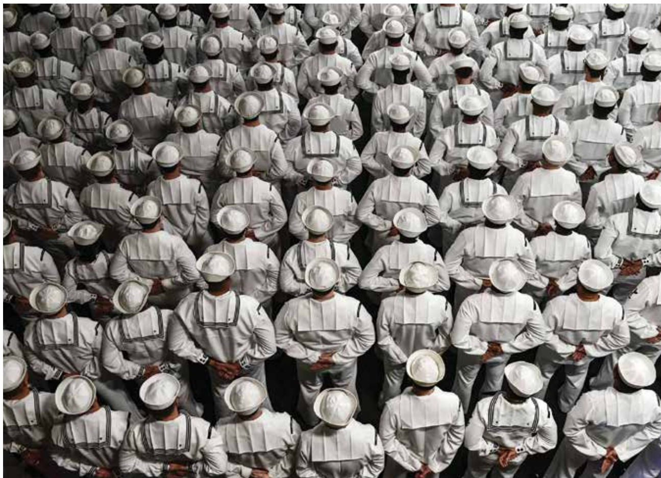
U.S. Sailors stand at parade rest during a Change of Command ceremony aboard the amphibious assault ship USS Wasp in Subic Bay, Philippines.