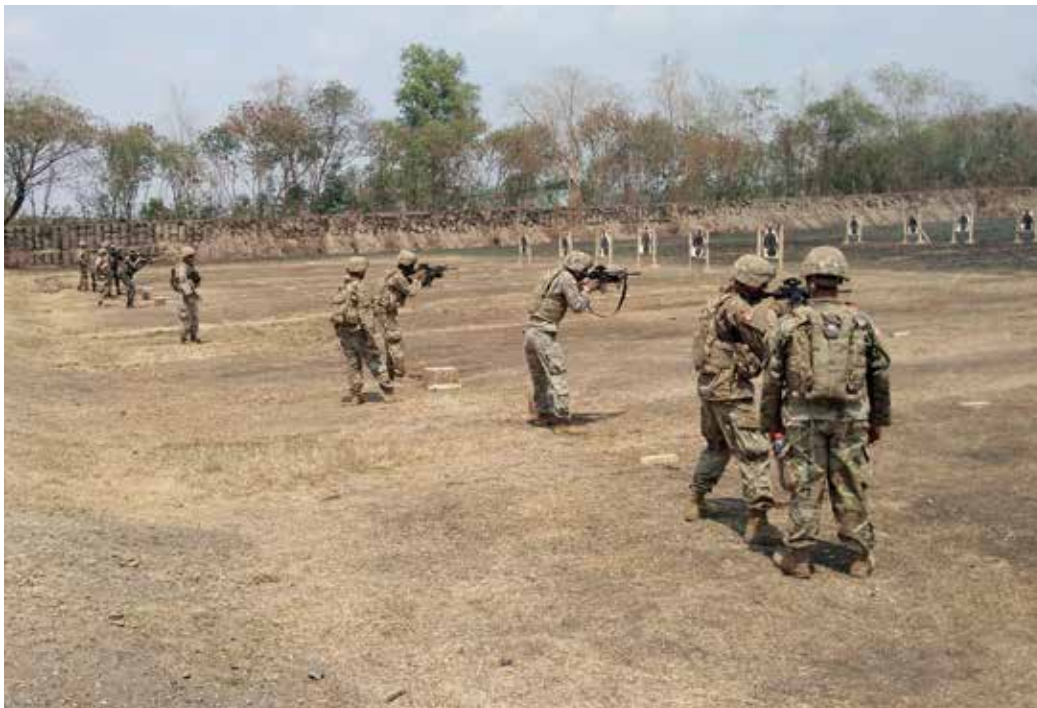
U.S. and Philippine soldiers hone their marksmanship skills at a range during Exercise Salaknib.

The DoS Bureau of Diplomatic Security, Bureau of Counterterrorism and Countering Violent Extremism, and U.S. Embassy Manila conducted 10 training courses with Philippine partners this quarter and has 23 planned for next quarter, according to the DoS. Courses conducted in the Philippines this quarter included crisis response and critical infrastructure, airport, and bus and rail system security. This training, provided through the DoS Anti-Terrorism Assistance program, was primarily directed toward the PNP's special security operations units, the Special Action Force. 73