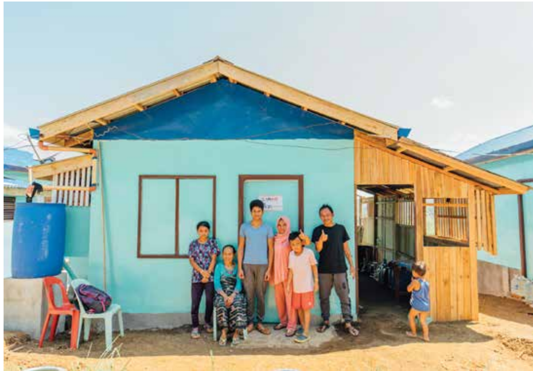
A temporary shelter in Pataon.