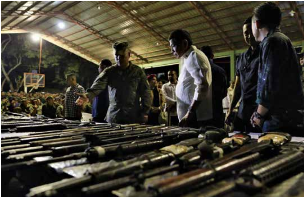
Philippine President Rodrigo Duterte inspects firearms confiscated from terrorists at Camp Teodulfo Bautista in Jolo, Sulu.

influential ISIS-EA leader in the Philippines, commanding the largest faction of fighters. He was also implicated in the Philippines' two deadliest terrorist attacks of 2019: the Jolo cathedral bombing in January and the Indanan army camp attack in June, which took place within 10 miles of each other on the island of Jolo. 46