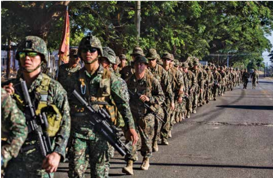
U.S. Marines march with Philippine Marines on their way to conduct room clearing drills during Exercise Balikatan at the Navy Education Training Command.

A report issued by the International Crisis Group this quarter stated that if the BARMM could meet popular expectations regarding delivery of public services, such as health, education, and infrastructure, it could mitigate the anti-government sentiments that have