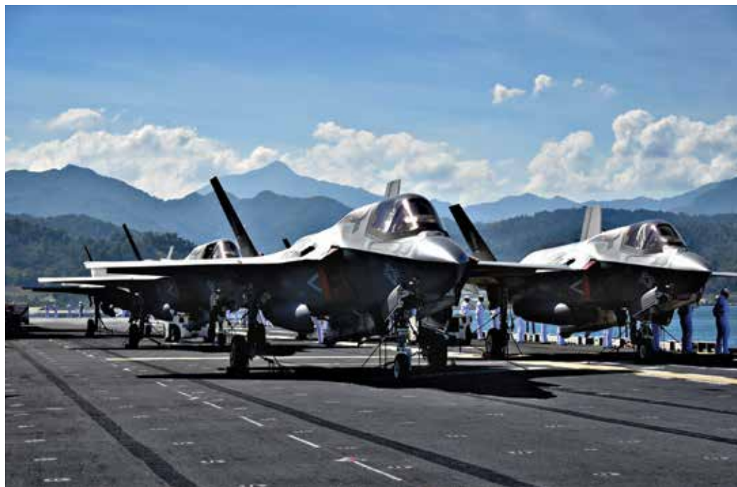
F-35B Lightning II aircraft are secured to the flight deck as sailors man the rails aboard the amphibious assault ship USS Wasp .

According to media sources, the 2019 Exercise Balikatan included training activities to prepare the AFP to combat both conventional military and insurgent threats. A U.S. Army spokesperson stated, “If [the Philippines] were to have any small islands taken over by a foreign military, this is definitely a dress rehearsal that can be used in the future.” Many of the elements of this exercise were requested by the 1-year old Philippine Special Operations Command to prepare for scenarios, such as a foreign-power invasion, while simultaneously fighting extremist militants. An AFP spokesperson told reporters that he hoped the training would address some of the issues that challenged the Philippine forces during the 2017 siege of Marawi, such as overreliance on special operations units and difficulty coordinating accurate airstrikes. 67