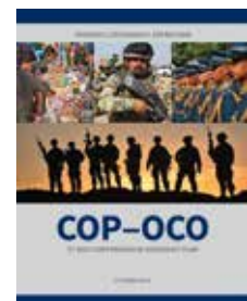
FY 2019 Comprehensive Oversight Plan for Overseas Contingency Operations

This quarter, the DoD OIG completed one report related to aviation readiness for units assigned to USINDOPACOM. USAID OIG completed one report related to a financial audit of a governance assistance project. As of June 30, 2019, four oversight projects were ongoing, and one was planned. Project titles and objectives for the ongoing and planned oversight projects can be found in Appendix C.