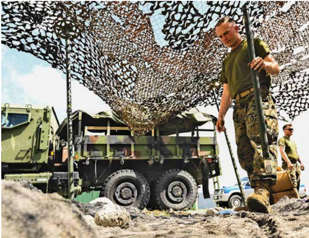
A U.S. Marine works on a terrain model during river crossing operations.

USAID reported that its programs in the Philippines this quarter focused primarily on rebuilding communities and countering violent extremism. The largest of these activities, the $25 million Marawi Response Program, provided micro-grants for 11,629 IDPs and 55 business recovery grants, along with workforce and entrepreneur training. USAID said that programs designed to counter violent extremism supported town halls related to the Bangsamoro peace process, interfaith dialogue between Muslims and Christians, efforts to prevent school dropouts, and conflict resolution skills for religious, women, and youth leaders. 21