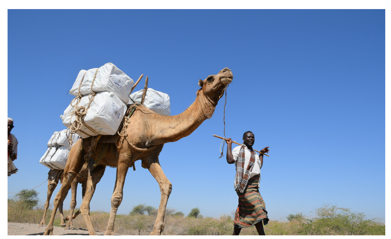
USAID coordinates with the Ethiopian Government to distribute treated bed nets by camel to the Afar people in one of the most remote and disadvantaged regions in Ethiopia. Photo: David Getachew, Photoshare (February 14, 2018)