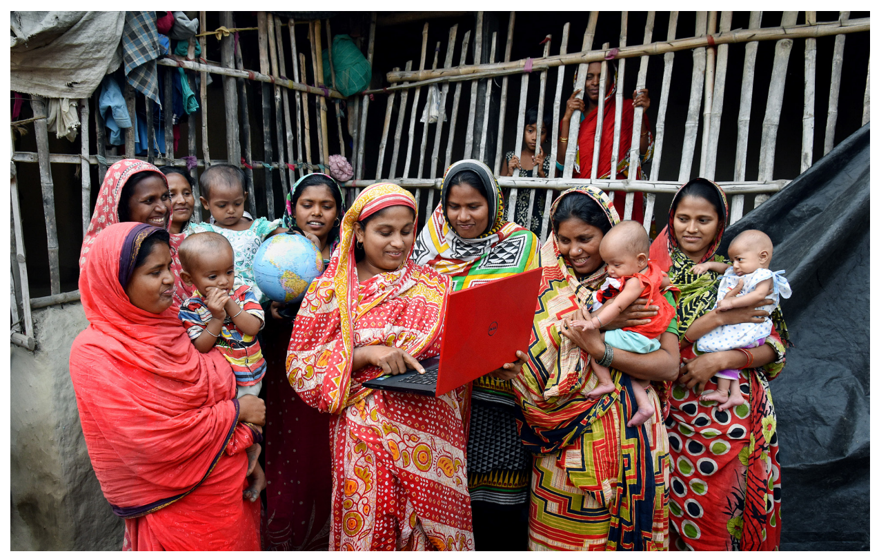
Village women in India use a laptop computer to search for information on reproductive health and family planning. Photo: Pranab Basak, Photoshare (January 1, 2017)