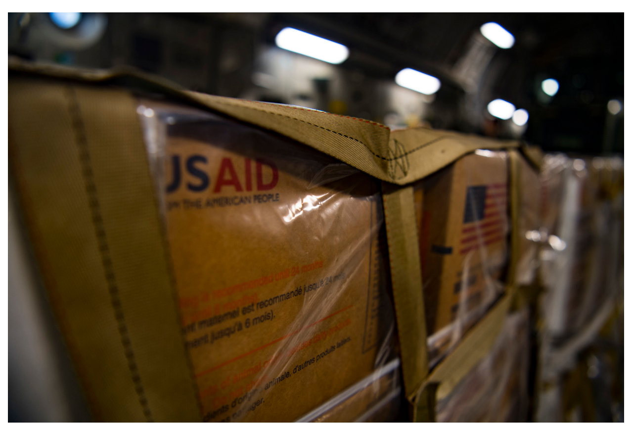
The U.S. Government airlifts humanitarian aid to Colombia for eventual distribution by relief organizations on the ground for Venezuelans impacted by the crisis in the country. (February 16, 2019)