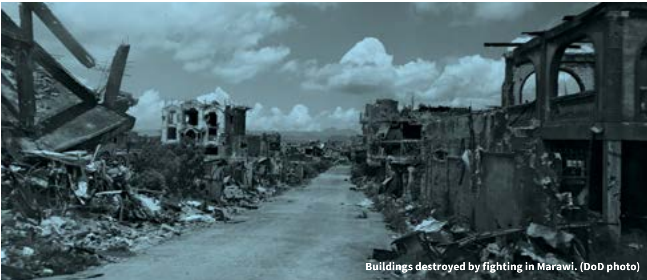
Buildings destroyed by fighting in Marawi.