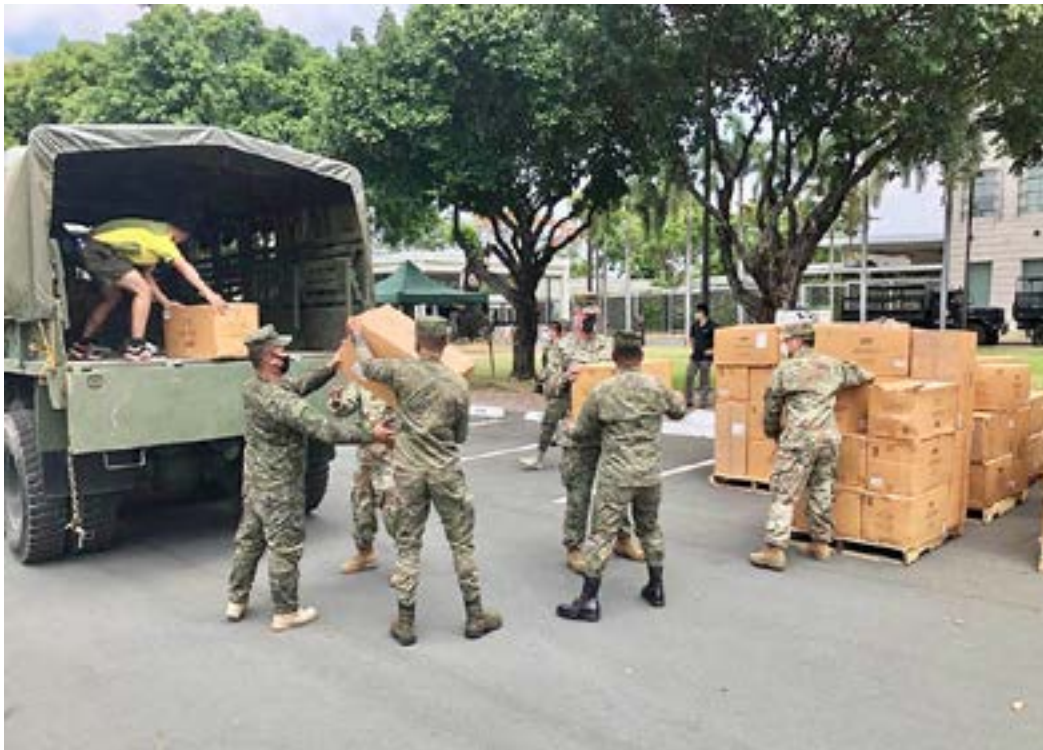
Philippine and U.S. service members load boxes of donated cots for delivery to the Philippines Office of Civil Defense to help the country's COVID-19 response.

Each OIG coordinates the review process with its own agency. During the first review, the Lead IG agencies ask their agencies to correct inaccuracies and provide additional documentation. The Lead IG agencies incorporate agency comments, where appropriate, and send the report back to the agencies for a second review. Each Lead IG agency participates in reviewing and editing the entire quarterly report.