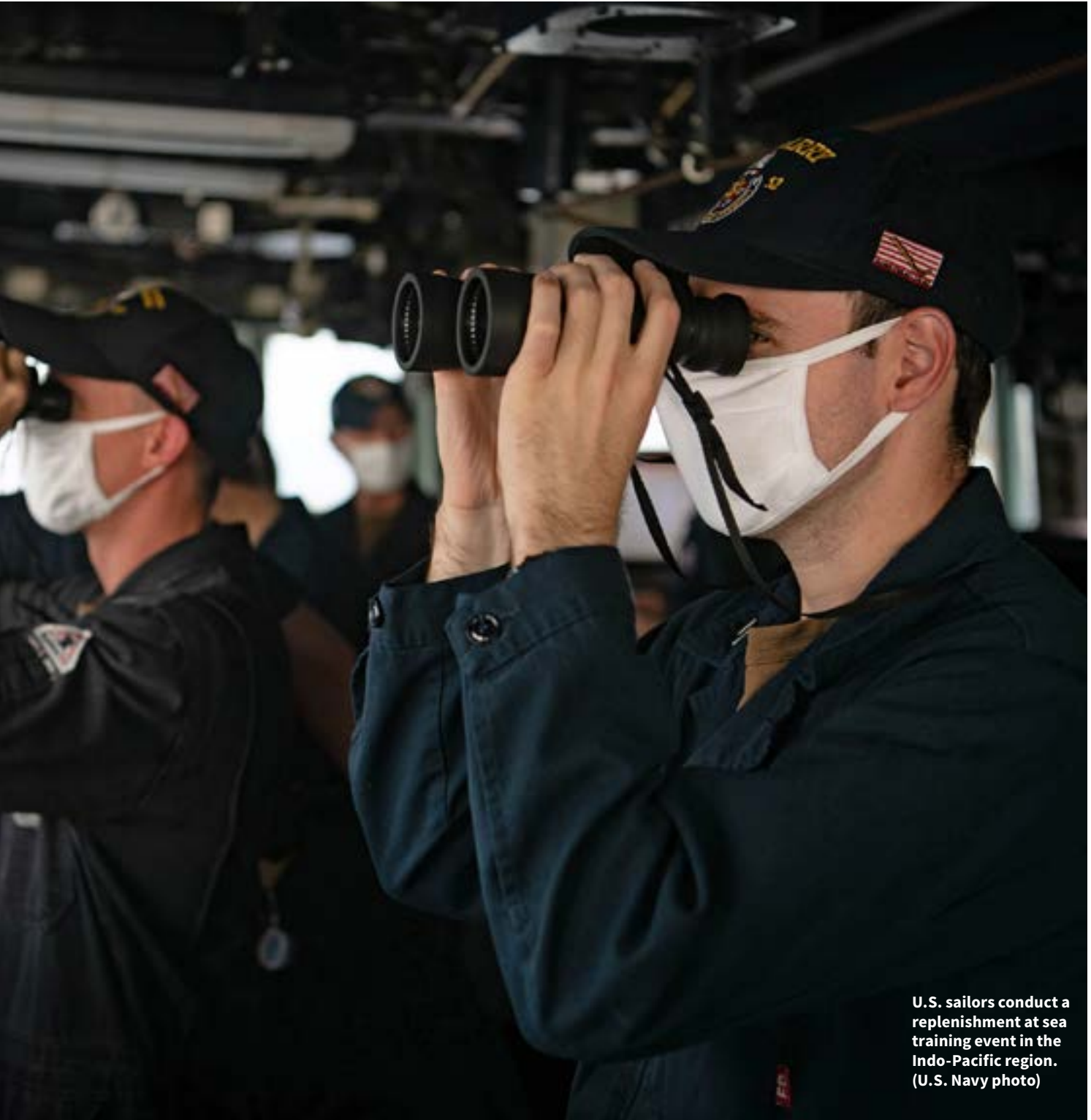
U.S. sailors conduct a replenishment at sea training event in the Indo-Pacific region.