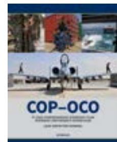
FY 2020 Comprehensive Oversight Plan for Overseas Contingency Operations