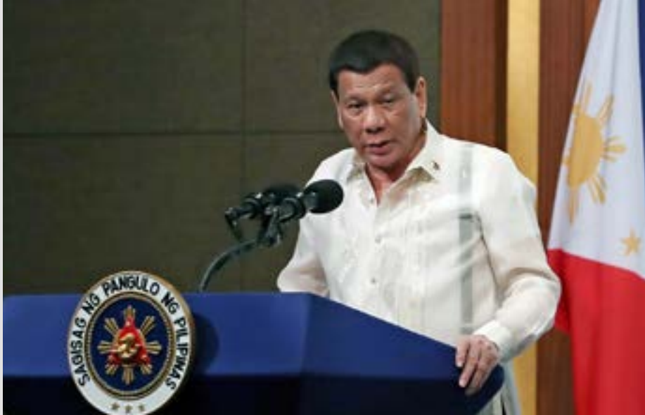
Philippine President Rodrigo Duterte speaking at a business forum in Seoul.

charged with “inciting” under the new law. 123 According to a media report, the law will create an Anti-Terrorism Council, to be appointed by President Duterte, which would have the authority to designate individuals and organizations as terrorists, who could then be detained without a warrant. 124