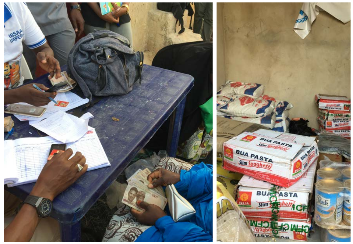
Left: A registered beneficiary receiving a cash distribution from a USAID implementer in Maiduguri, the capital of Borno state in Nigeria. Right: Inventory of an onsite vendor available if beneficiaries want to use the cash to purchase goods. (March 5, 2018)

USAID continued to ramp up its response and ultimately made awards active at some point during fiscal years 2015-2017 valued at $1.1 billion in the Lake Chad region. This region comprises Cameroon's Far North Region, Chad's Lac Region, Niger's Diffa Region, and three states in northeast Nigeria—Adamawa, Borno, and Yobe. The funding provided cash and food vouchers to internally displaced persons and vulnerable host community members; emergency supplies such as hygiene kits, bedding, and kitchen sets; and shelters, sanitation facilities, and clean water to camps and conflict-affected people.<sup>5</sup>