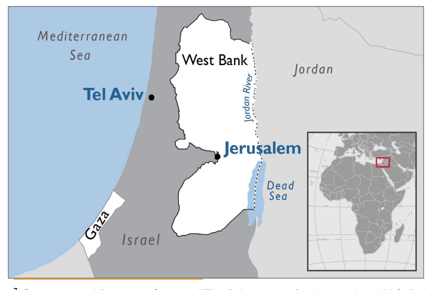
Figure 2. USAID Administers Assistance to West Bank and Gaza From Israel

The depiction and use of boundaries and geographic names used on this map do not imply official endorsement or acceptance by the U.S. government.