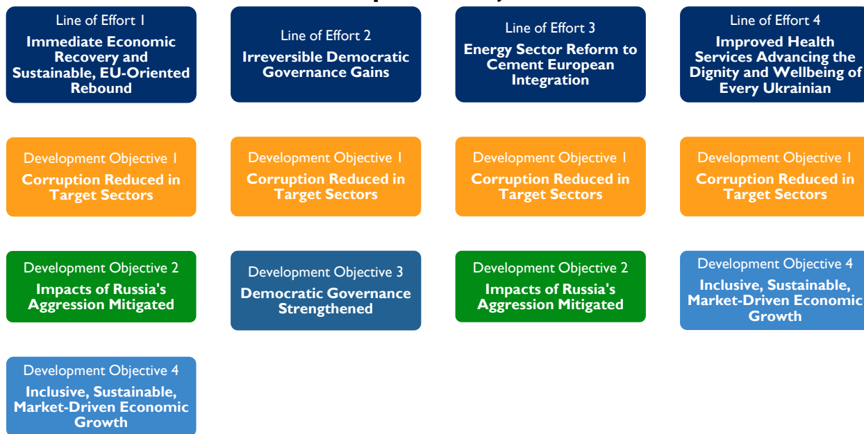
Figure 4. Strategic Framework Lines of Effort Alignment with USAID/Ukraine CDCS Development Objectives