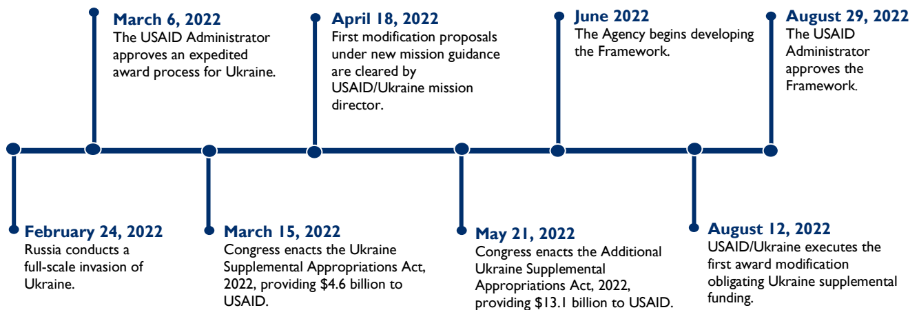
Figure I. Timeline of Key Events