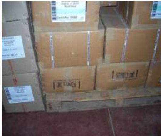
Photograph of improperly stacked commodities. Commodities on the left were not placed on pallets. Another box is shown stored upside down.