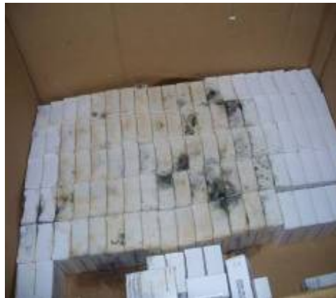
Photograph of mildew on boxes of HIV test reagents.

The problems described above were partly due to the lack of training for warehouse staff and the transition of responsibility for the storage of commodities from Medimoc (formerly a state-owned but now a private company) to the Center for Medicines and Medical Supplies when Medimoc's contract ended in December 2007. 11 A contributing factor was that the SCMS in Mozambique had not fully implemented standard operating procedures for ensuring the following: