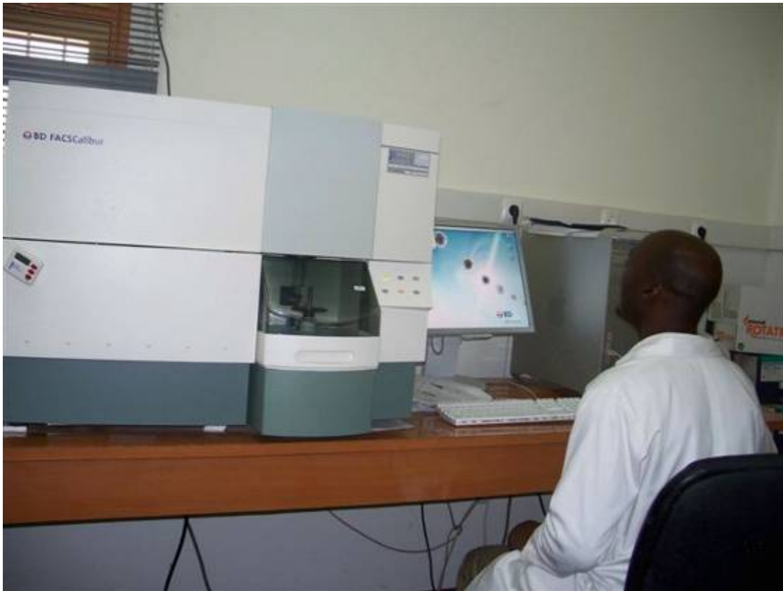
Photograph of CD4 counting machine and the technician in Ponta Gea Health Center Laboratory in Beira, Sofala province.

of the implementing partners that had expired kits provided a copy of the notice from Mozambique's Ministry of Health National Reference Laboratory for the diagnosis of HIV indicating that the expired test kits could still be used up to 90 days after the expiry date.