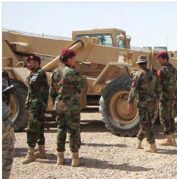
Inspection of heavy equipment.

U.S. reconstruction funds have been applied to the core task of building and sustaining the Afghan National Security Forces (ANSF), promoting governance and rule of law, supporting anticorruption and counternarcotics initiatives, and fostering economic development.