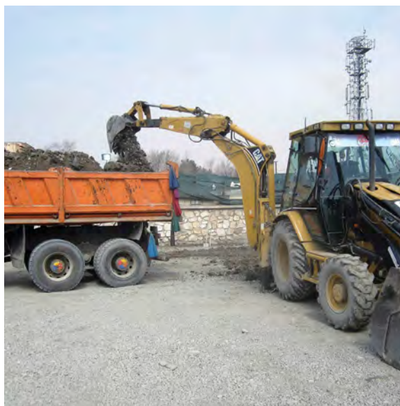
Construction at Camp Sullivan.