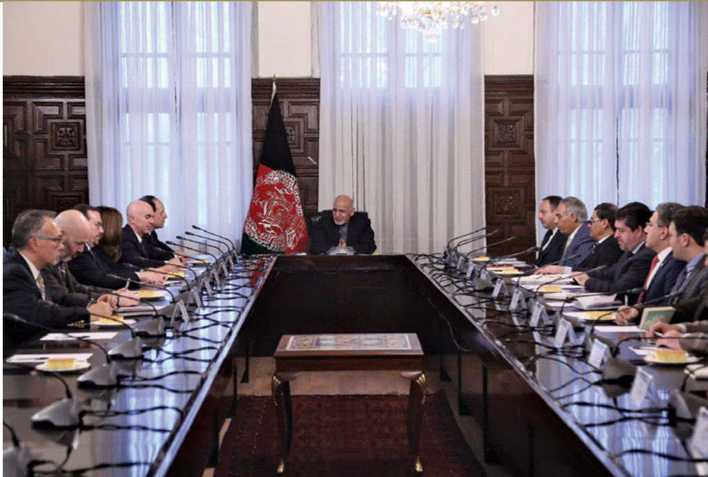
The Inspectors General responsible for Lead IG oversight meet with Afghan President Ashraf Ghani and his cabinet ministers in Kabul.