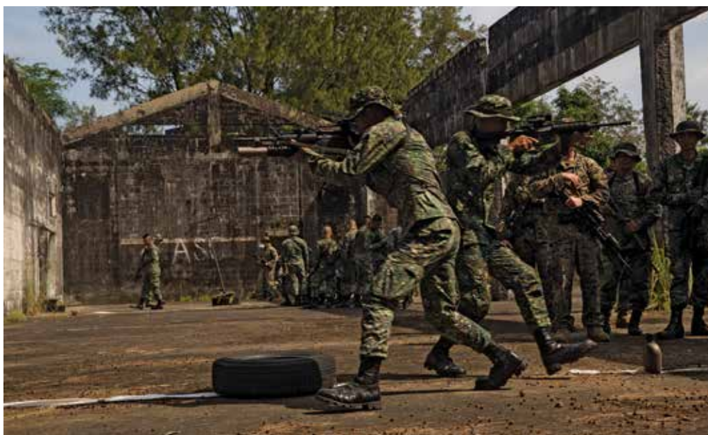
Philippine Marines clear a simulated room during a training exercise.