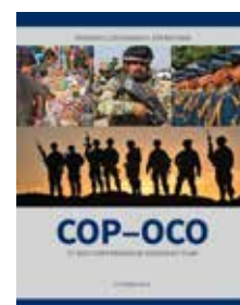
FY 2019 Comprehensive Oversight Plan for Overseas Contingency Operations

This quarter, the Lead IG agencies and their partner agencies completed one report related to OPE-P. As of December 31, 2018, four oversight projects were ongoing, and two were planned. Table 2 lists the project titles and objectives for the ongoing projects, and Table 3 lists the project titles and objectives for the planned projects.