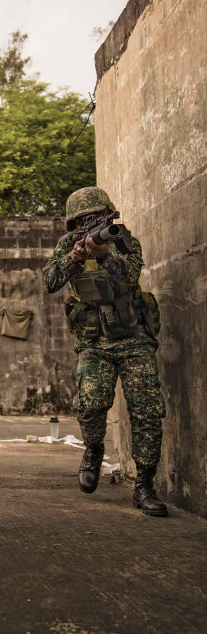
A U.S. and a Philippine Marine clear a room during a training exercise as part of Kamandag 2 in the Philippines.