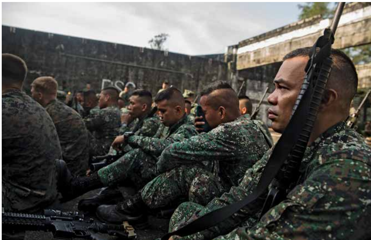
Philippine and U.S. Marines listen to a class during a training exercise.

has resulted in the AFP effectively assuming airborne ISR of a target or operation from overhead U.S. ISR platforms. USSOCPAC reported that AFP special operations forces have increased the level and frequency of coordination between ground forces and air units. USSOCPAC also reported that advise and assist efforts “at the West Mindanao Command Unified Office of Intelligence level has integrated operational planning and employment of the AFP’s organic ISR platforms with their own internal collection planning priorities.” 46