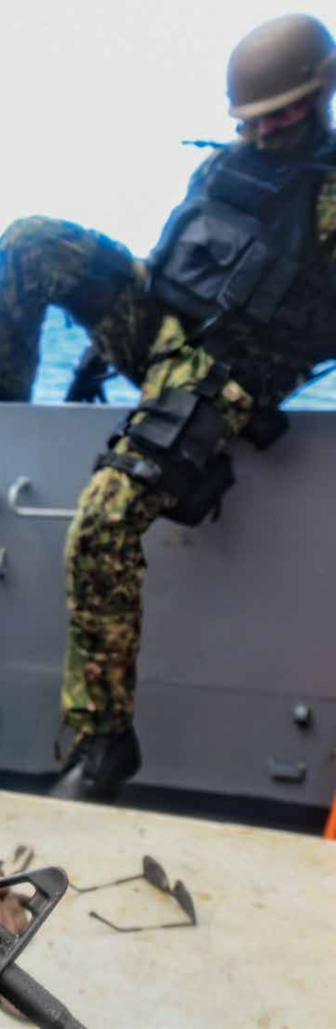
U.S. security forces board a vessel during a training exercise in the Philippine Sea.