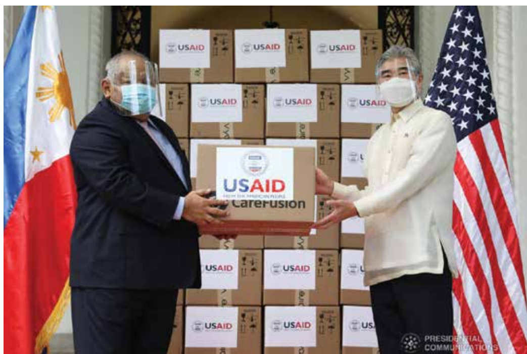
Executive Secretary of the Philippines Salvador Medialdea (left) receives one of the 100 U.S.-donated ventilators from U.S. Ambassador to the Philippines Sung Kim (right).

More broadly, USAID reported that it delivered 100 ventilators to the Philippine government on August 28. 205 This delivery included clinical training sessions and additional medical supplies and consumables that would sustain use for 2- patients per ventilator, depending on use. 206 The recipient hospitals and government entities will assume responsibility for costs associated with maintaining the equipment after the expiration