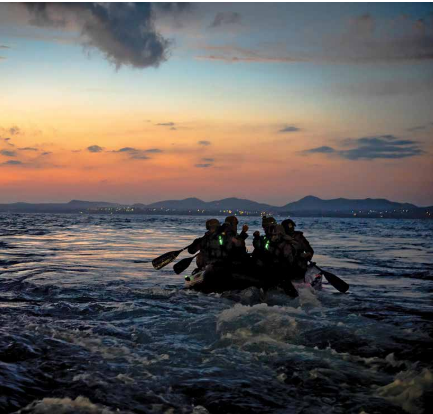
U.S. Marines conduct a boat raid exercise in the Philippine Sea.