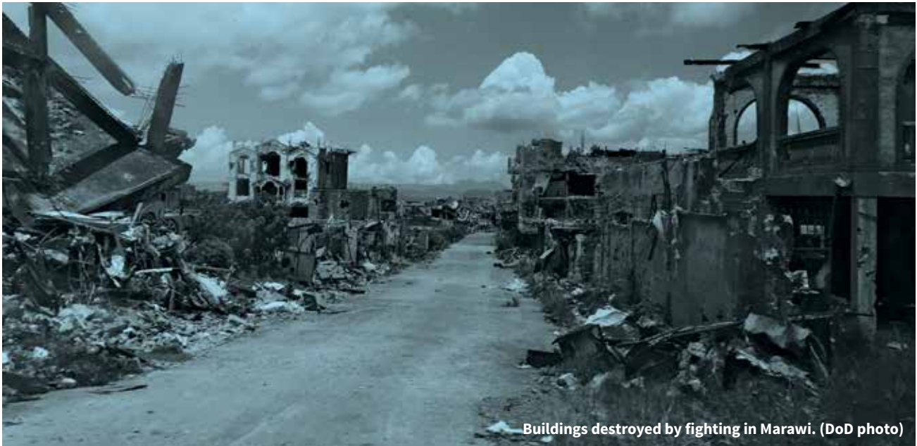
Buildings destroyed by fighting in Marawi.