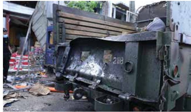
Aftermath of the twin bombings at Barangay Walled City in Jolo, Sulu, on August 24.