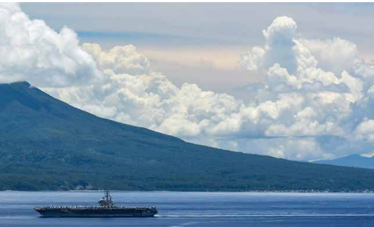
Aircraft carrier USS Ronald Reagan steams through the San Bernardino Strait, crossing from the Philippine Sea into the South China Sea.

report are listed in endnotes or notes to tables and figures. Except in the case of audits, inspections, investigations, and evaluations referenced in this report, the Lead IG agencies have not verified or audited the information collected through open-source research or from Federal agencies, and the information provided represents the view of the source cited in each instance.