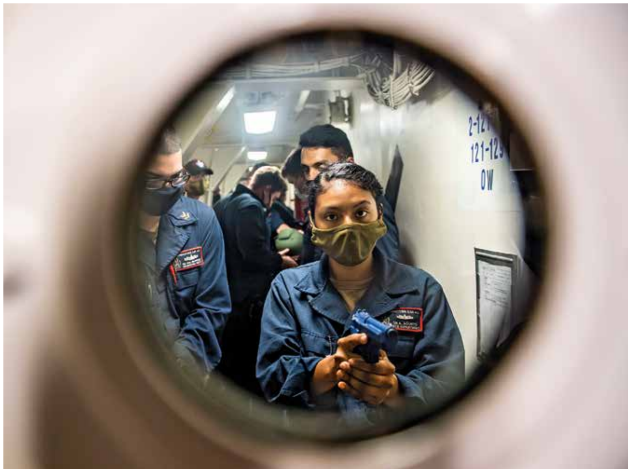
U.S. Sailors participate in an antiterrorism training exercise.