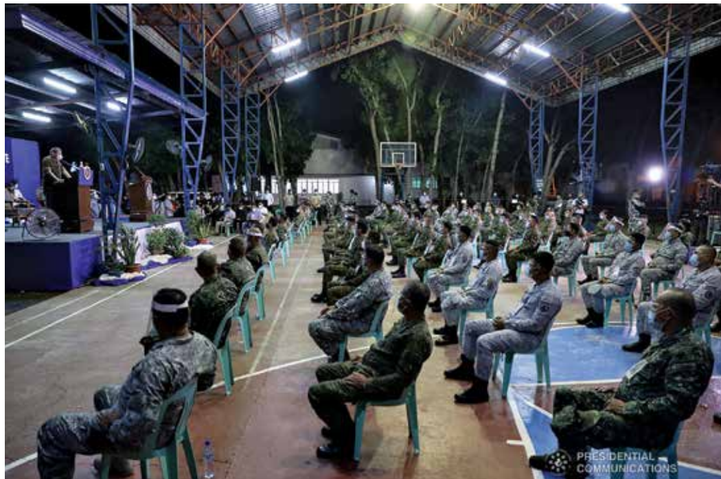
Philippine President Rodrigo Duterte talks to troops at Edwin Andrews Air Base in Zamboanga City.

U.S. special operations forces conducted four subject matter exchanges and assisted two local medical staffs with patient assessments and transfers, according to SOCPAC. 107