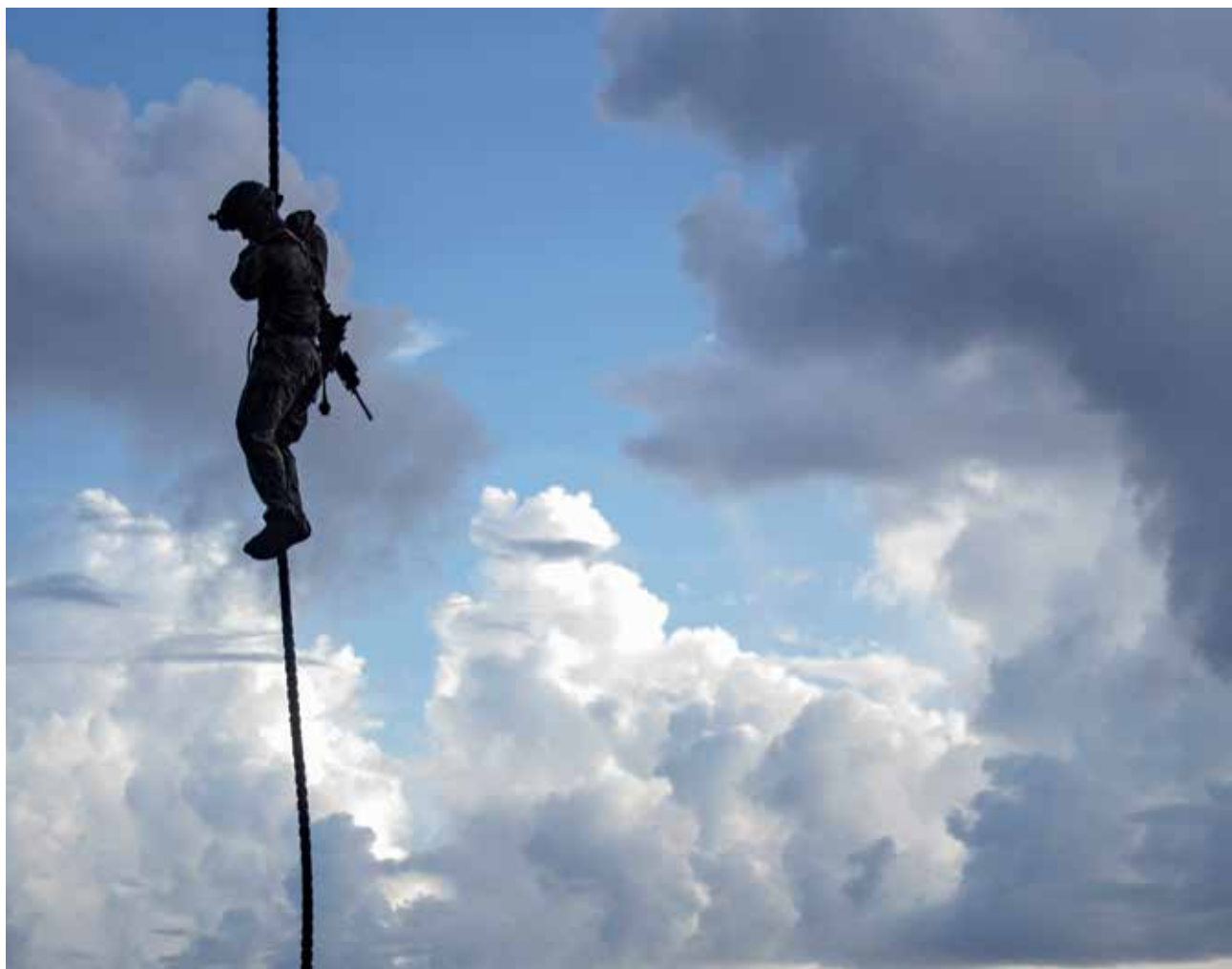
A U.S. Marine fast ropes from an MV-22B Osprey in a training exercise.