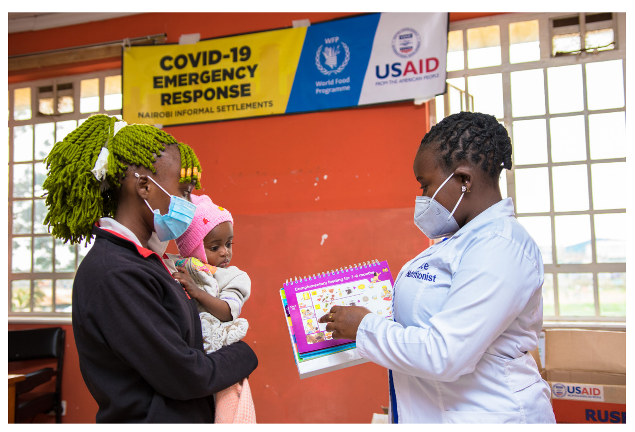
As part of USAID and the World Food Programme's COVID-19 Emergency Response in Mukuru Kwa Reuben Urban Settlement, selected families receive nutrition supplements and cash transfers. (August 13, 2020)