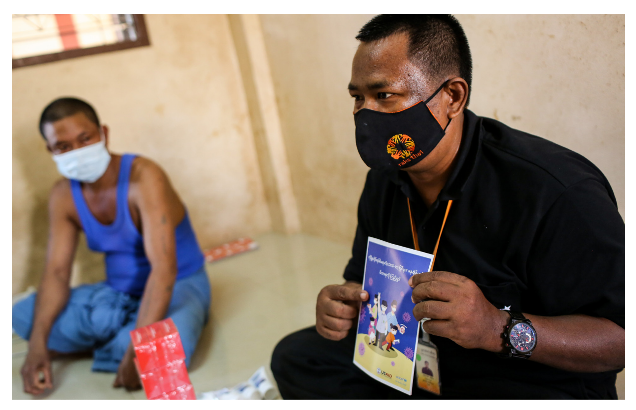
In partnership with UNICEF, USAID and implementers hold sessions to educate Myanmar factory workers on COVID-19 prevention. Photo: UNICEF/Thailand (June 11, 2020)