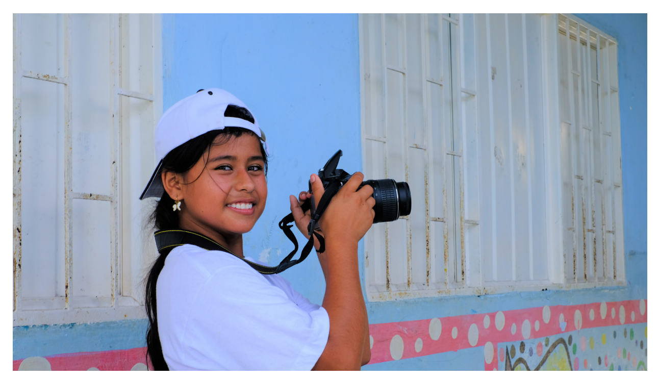
Through filmmaking workshops, children and youth learn skills to make their own short films as part of a USAID project to promote community reconciliation in Colombia. (September 11, 2020)