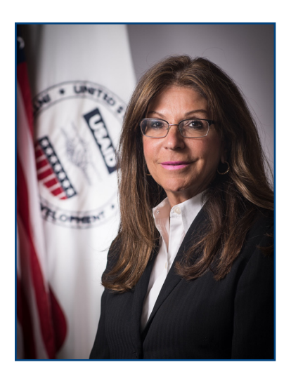
Ann Calvaresi Barr Inspector General

USAID provides humanitarian and stabilization assistance to people in countries recovering from natural disasters and armed conflict, as well as assistance in combating disease, food insecurity, child and maternal mortality, and gender-based violence. The United Nations recently reported that new and ongoing crises displaced nearly 80 million people at the end of 2019. Prolonged conflict has left over 13 million people internally displaced in Afghanistan, Iraq, Syria, and Yemen, while on the other side of the world, violence and political unrest have displaced 4.5 million Venezuelans. The global spread of COVID-19 added new threats for populations already lacking access to food, medicine, and basic services.