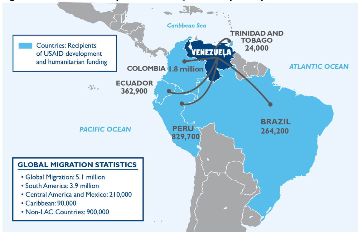
Figure 1. Venezuela Population Outflows Map – September 2020

The depiction and use of boundaries and geographic names used on this map do not imply official endorsement or acceptance by the U.S. Government.