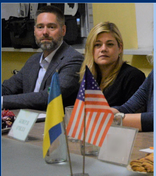
Acting Deputy Inspector General Angarella at the Korczowa/Krakovets Border Crossing meeting with the State Border Guard Service of Ukraine to discuss the flow of supplies, people, and aid into and out of Ukraine. Photo: Ukrainian Official (July 2022)

USAID OIG's top priority during this reporting period and for the foreseeable future is providing comprehensive oversight of USAID's support of Ukraine and its people in response to the devastating effects caused by Russia's invasion. The goal of our Ukraine oversight plan is to conduct work that is timely, relevant, impactful, and informative. The success and impact of our oversight is grounded in the following principles: