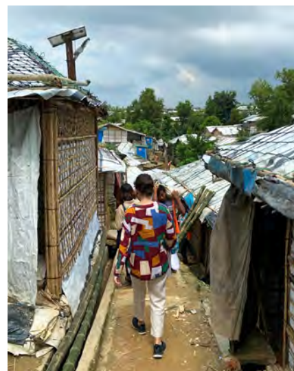
OIG team members walk past the makeshift shelters made of tarp and bamboo sticks in the Rohingya refugees camps in Cox's Bazar, Bangladesh.

We also continue to play a key role on task forces that disrupted human trafficking networks, foreign gangs, and pandemic relief fraud. For example, as part of Joint Task Force Vulcan, our investigators assisted in arresting a high-ranking MS-13 fugitive on a terrorism indictment.