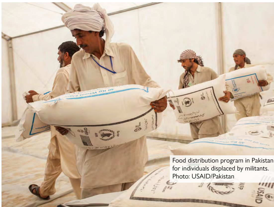
Food distribution program in Pakistan for individuals displaced by militants.