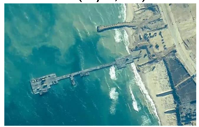
Figure 2. JLOTS Temporary Pier on the Gaza Coast (May 16, 2024)

For Gaza, this multinational operation has involved the United States, led by USAID and DoD, with assistance from Cyprus, Israel, the UN, and other foreign donors, including the United Arab Emirates, the United Kingdom, and the European Union. <sup>11</sup> DoD dedicated more than 1,000 U.S. soldiers and sailors, as well as several ships, to this project. Engineers from the Israel Defense Forces (IDF) anchored the temporary pier to the shore to ensure U.S. military personnel would not have to enter Gaza in keeping with the President's mandate of no U.S. military "boots on the ground" in Gaza. DoD construction of the temporary pier was completed on May 16, 2024; delivery of humanitarian assistance to Gaza began the following day. Figures 2 and 3 show an aerial view of the pier and the floating platform positioned about 5 miles offshore.