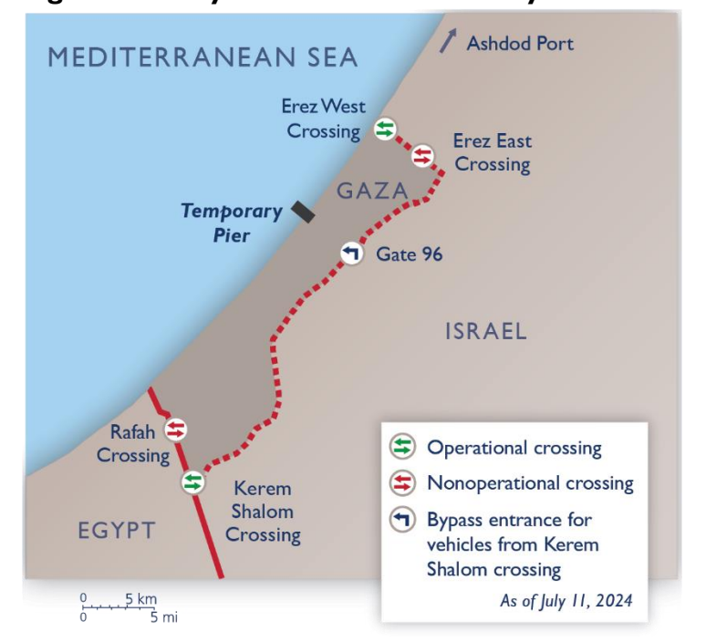
Figure I. Entry Points for the Delivery of Humanitarian Aid into Gaza

Since the outbreak of hostilities in October 2023, numerous and prolonged border closures have significantly affected the flow of humanitarian aid into Gaza. Figure I shows entry points for humanitarian aid into the region.