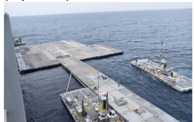
Figure 3. JLOTS Floating Platform (May 16, 2024)