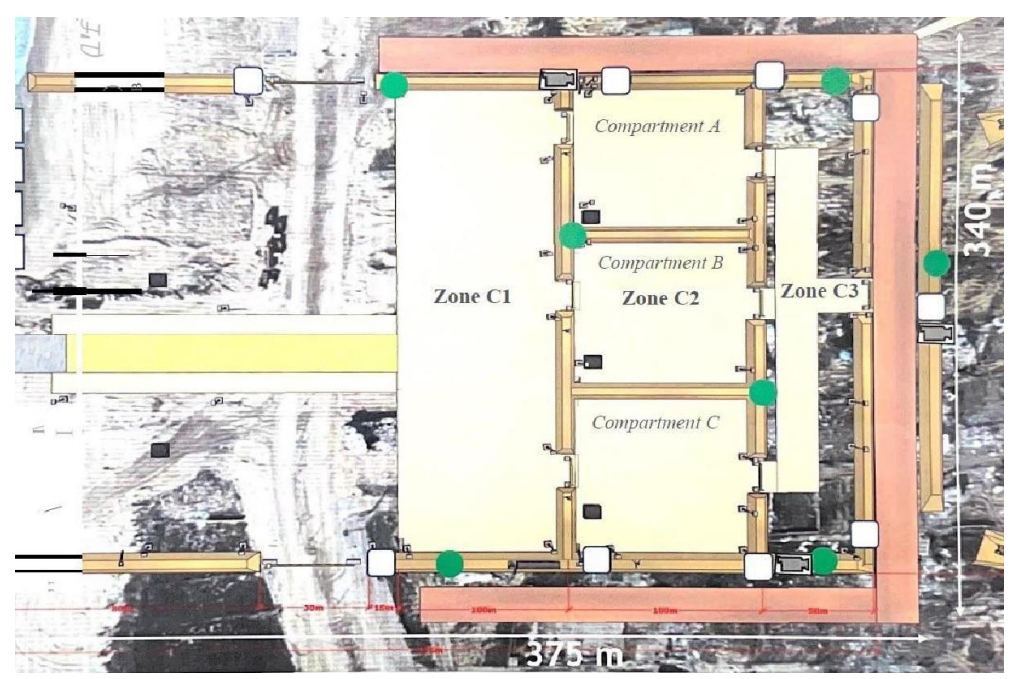
Figure 5. Design of Module C