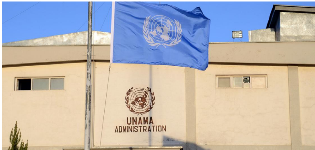
Headquarters of the UN Assistance Mission in Afghanistan in Kabul.