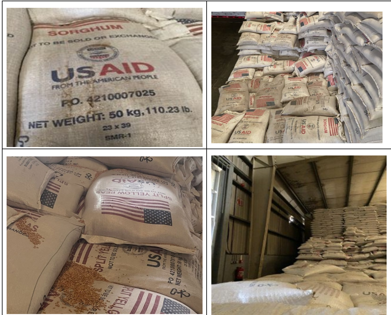
Top row: Bags of sorghum are covered in dirt and dust. Bottom left: Bags of yellow split peas show holes and tears, causing spillage. Bottom right: Food aid is stacked high to the water-damaged ceiling. (June 2025, Djibouti City, Djibouti).